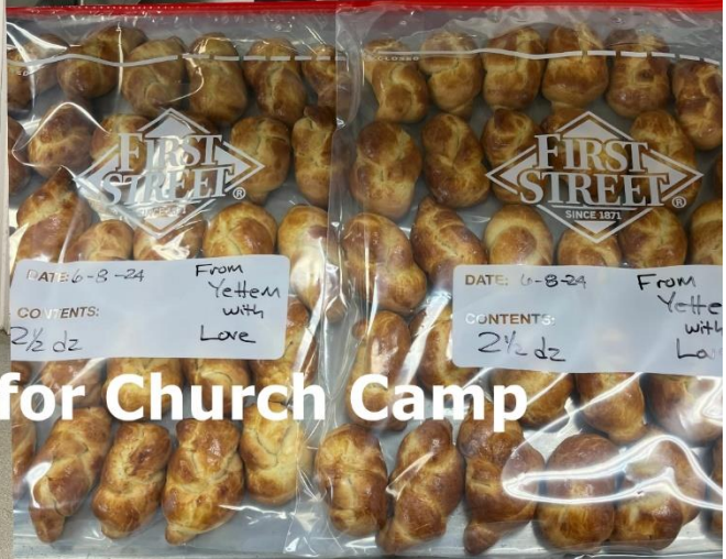
Making 600+ Choregs for Church Camp June 8, 2024