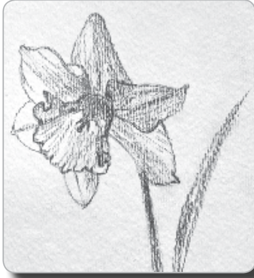
Daffodil by Beth Henson

As I turned away, I couldn't help but suppress a smile as I daydreamed of next month. My little beauties would be the envy of the neighborhood, and those cold weather showoffs - just a distant memory!