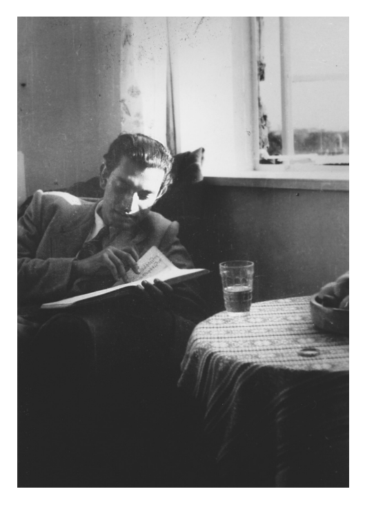
Ray reading a music score, London, 1950

unacknowledged tribute to Tagore's unique and overwhelming impact in Germany in the 1920s.