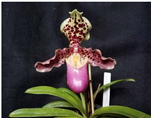
PAPHIOPEDILUM HENRYANUM