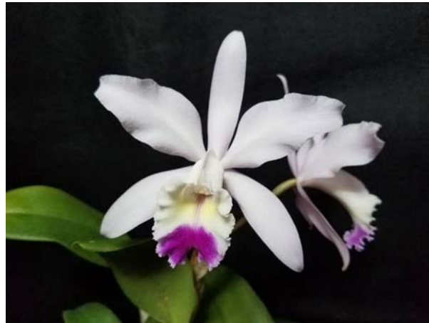
Cattleya loddigesii