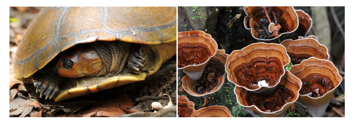
Tortoise [Galapagos trail]; Fungus [terra firme forest]

With the trucks now running more reliably, our final two days were focused squarely on birding the terra firme forest, especially the damper, Junglaven side. A very early start from Camani and a trouble-free 45 minute drive saw us at the Junglaven camp around dawn and we were rewarded with eerie Long-billed Woodcreepers in trees near the camp and an Amazonian Umbrellabird perched and flying across the lagoon. Our morning's walk though the forest was also highly productive: 10 minutes into the forest I finally found my first ever Yellow-billed Jacamar, then Cinnerous Mourner, Grayish Mourner, a pair of Yellow-throated Woodpeckers, Black-bellied Cuckoo, Black Nunbird, Rusty-breasted Nunlet, Gilded Barbet and White-throated Manakin all followed. We continued birding through the early afternoon, including an unsuccessful attempt to find the Ground-Cuckoo with Tom and Melissa. This time we never heard any 'wooo' responses and although we did hear some distant bill-clacking it never reached anything like the frenetic pace or volume we had heard previously. David M-K made a brief fishing trip on the big lagoon, catching several pavón (Peacock Bass) for our dinner before storm clouds threatened and we retreated back towards Camani in the truck, on the way spotting a pair of Crestless Curassows walking along the road.