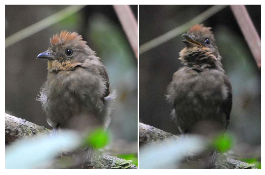
Thrush-like Schiffornis calling [terra firme forest]

A Thrush-like Schiffornis heard calling deep in the forest was eventually well seen after a tough scramble through thick vegetation. It was very rewarding to finally see this curious creature calling from a branch low down in the dark forest interior - very reminiscent of an antpitta - whilst the rufous crest and light cinnamon throat were a surprise, given the rather uniform brown illustrations on the plates of both Hilty and Restall.