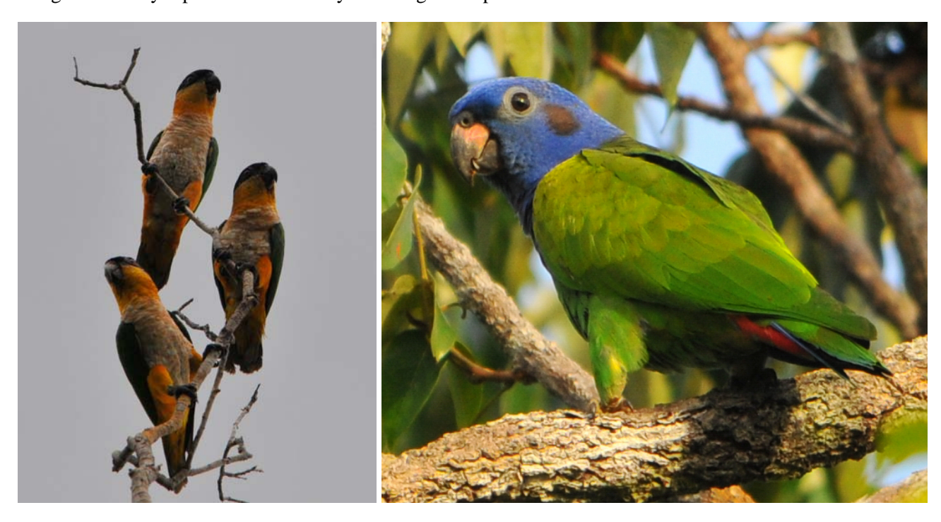
Black-headed Parrots; Blue-headed Parrot [both near Junglaven camp]

The following day we were determined to leave for Junglaven before dawn (05:30), intent on spending the whole day in the forest at the far end of the road. Unfortunately the truck took considerable coaxing to life and following our delayed departure it then failed to climb the first small hill we encountered in the forest. Thereafter we walked the road in the direction of Junglaven, receiving periodic lifts when the revived truck caught us up, then walking when it died again. In this way we made gradual progress through the forest, birding as we went. The best birds encountered were Ruddy Spinetails (that responded vigorously to playback) and Gray-winged Trumpeters, whilst Red-Howler Monkeys called distantly and a Southern Tamandua Anteater was spotted sleeping in a tall tree. By 08:00 we had reached the Junglaven camp, which was indeed in considerably worse shape than I remembered, and although Capitan Lorenzo expressed confidence that it would be habitable in time for his next visitors in January, there appeared no hope of it being sufficiently repaired for us to stay at during our trip.