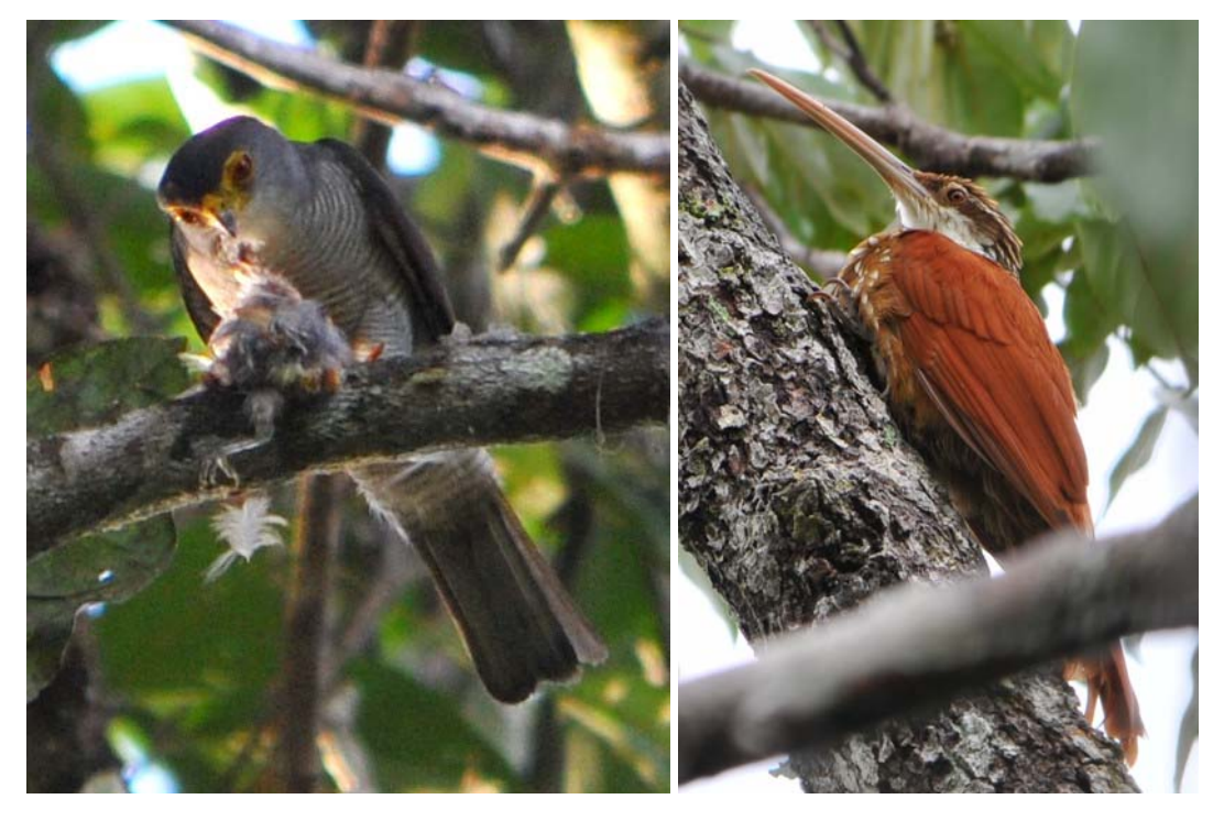
Tiny Hawk plucking its prey [terra firme forest]; Long-billed Woodcreeper [Junglaven camp]

We then encountered our only army ant swarm of the trip, although in truth it was a very modest swarm compared with the torrents of ants I have seen swarming in Imataca. Nonetheless we could hear some antibrd calls in the distance and before long we had a pair of Rufous-throated Antibrds in clear sight. After a packed lunch near the 'Big Tree' we continued walking towards the savannah, securing good views of a Variegated Tinamou, Olive Oropendolas, Red-throated Caracaras and a mixed flock including a pair of Spot-winged Antshrikes. Although we were frustrated by several Spot-backed Antibrds that came close whilst ultimately remained largely hidden from view, we did reasonably well overall in finding a good number of our target antshrike/bird/wren skulkers.