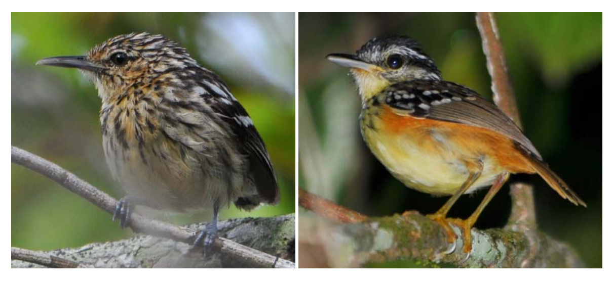
Cherrie's Antwren (female) [varzea scrub near to Junglaven]; Imeri Warbling Antbird [terra firme forest]

Our first day's birding commenced with a hike across the savannah in pleasant early-morning temperatures as we searched for savannah and white-sand forest specialties. The light was wonderful (we had near perfect weather the whole trip, with only a couple of brief rain storms) and although the birding in this dry environment was slow, notable sightings included close-up views of a Green-tailed Goldenthroat on its nest in the savannah scrub, a Rufous-crowned Elaenia, pairs of red-and-green Macaws passing over and multiple cat prints, both large and small. After about 5km of flat, sandy trails we reached the entrance to the terra firme forest that grows on the more elevated lateritic soils, and we continued for a couple of kilometres along the undulating dirt road in the welcome cool of the forest. Highlights included Ringed Woodpeckers (the barred subspecies illustrated in Restall but not in Hilty), a flock of Gray-winged Trumpeters flushed from the road, successfully finding one of the many Dwarf Tyrant-Manakins calling from their mid-story perches and our first taste of Amazonian Antshrikes, White-flanked Antwrens and Imeri Warbling Antbirds - which proved to be three of the more common antshrike/wren/bird species found during the week.