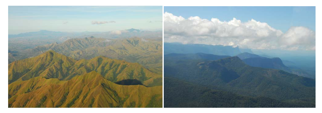
Flying from deforested Coastal Cordillera to the unbroken forested landscape of Amazonas

By flying directly from Caracas to Amazonas in our friend Francisco's Cessna, we saved considerable time (avoiding an overnight connection between the daily scheduled flight to Puerto Ayacucho and a local bush charter) and improved the trip's safety (being grateful for a reliable, well maintained and professionally piloted plane!). We also got to appreciate the Venezuelan landscape as it transitioned below us from the Coastal Cordillera via dry upper Llanos to the wet, flat, lower Llanos dissected by rivers and, finally, the mighty Río Orinoco and frontier town of Puerto Ayacucho some 2 hours 20 minutes later. Ever-increasing restrictions on foreign tourists in Amazonas prevented us from flying directly into the heart of the state so, despite having appropriate documentation in place, we were obliged to wait a short while in Puerto Ayacucho while local military authorities approved our onward journey. Even then we were not permitted to fly directly to either the Junglaven or Camani airstrips, and instead we flew to San Juan de Manapiare. This flight lasted just under one hour and provided absolutely spectacular views of endless, forest-cloaked hills and valleys, broken only by steep rock faces, narrow rivers cutting through the valleys and waterfalls cascading across sheets of black rock.