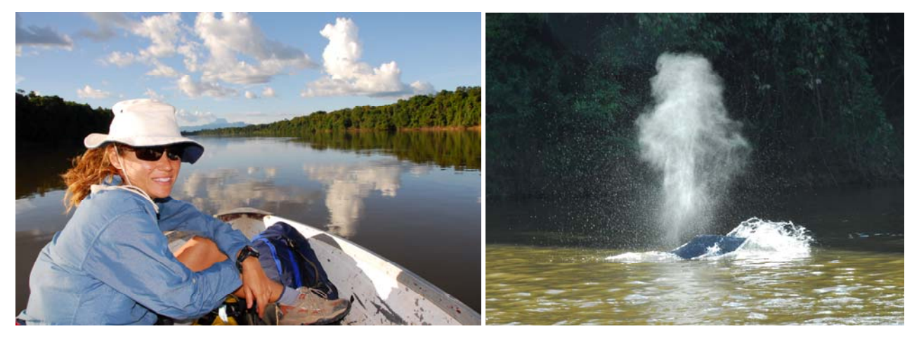
River travel; Pink River Dolphin exhaling [both on Río Manapiare]

At San Juan de Manapiare we stocked up on food and drink supplies (there is no beer, rum or soft drinks at Junglaven) and we were met by boats which took us on a 2 ½ hour river trip, first south on the Río Manapiare and then west on the Río Ventuari. Both rivers were teeming with pink river dolphins - more than we have encountered anywhere before - and we stopped several times to enjoy close-up views of different pods. Flocks of Neotropic Cormorants skimming the silvery waters of the Ventuari at dusk were another memorable sight.