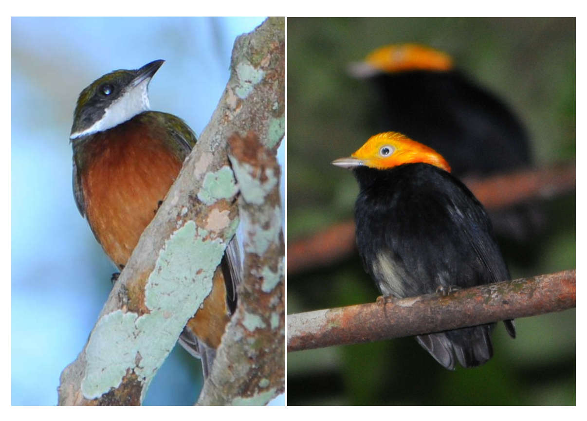
Yellow-crested Manakin [Galapagos trail]; Golden-headed Manakins [lowland forest near to Camani]

With the trucks now running more reliably, our final two days were focused squarely on birding the terra firme forest, especially the damper, Junglaven side. A very early start from Camani and a trouble-free 45 minute drive saw us at the Junglaven camp around dawn and we were rewarded with eerie Long-billed Woodcreepers in trees near the camp and an Amazonian Umbrellabird perched and flying across the lagoon. Our morning's walk though the forest was also highly productive: 10 minutes into the forest I finally found my first ever Yellow-billed Jacamar, then Cinnerous Mourner, Grayish Mourner, a pair of Yellow-throated Woodpeckers, Black-bellied Cuckoo, Black Nunbird, Rusty-breasted Nunlet, Gilded Barbet and White-throated Manakin all followed. We continued birding through the early afternoon, including an unsuccessful attempt to find the Ground-Cuckoo with Tom and Melissa. This time we never heard any 'wooo' responses and although we did hear some distant bill-clacking it never reached anything like the frenetic pace or volume we had heard previously. David M-K made a brief fishing trip on the big lagoon, catching several pavón (Peacock Bass) for our dinner before storm clouds threatened and we retreated back towards Camani in the truck, on the way spotting a pair of Crestless Curassows walking along the road.