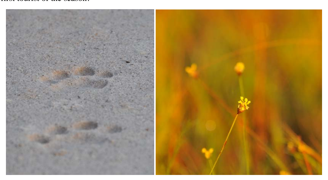
Jaguar prints; Flowers in evening light [both on savannah near Camani]

well-equipped camp, complete with swimming pool) located on the edge of the hot savannah, rather than at our preferred Junglaven location (16km away) overlooking a lagoon and surrounded by the cool, terra firme forest that contained most of our target species. Compounding the logistical challenges, both the Junglaven and Camani trucks were out of service, so we would have to hike everywhere until these were fixed (but not to worry, 'the mechanic will be arriving tomorrow to fix them'). All very reminiscent of 2005, when I was also the first tourist of the season!