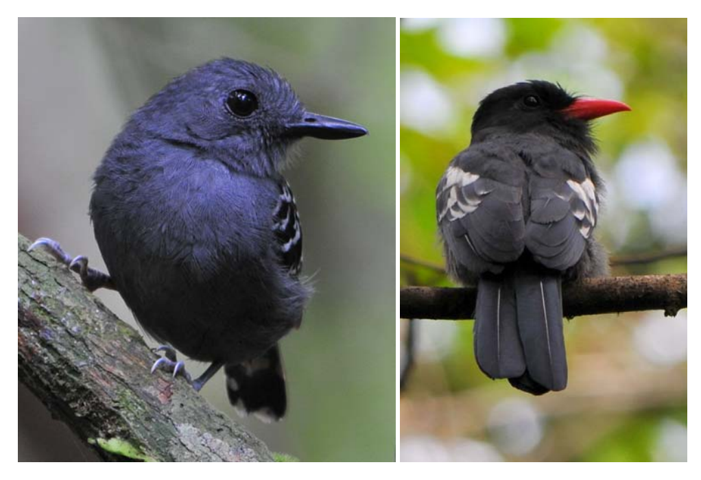
Scale-backed Antbird [terra firme forest]; Black Nunbird [lowland forest near to Camani]

Our final day was a repeat of the previous day's successful formula and delivered the best morning's birding of the trip. During the dawn drive towards Junglaven we saw a pair of Black Curassows and both Undulated Tinamou and Variegated Tinamou, then on our walk back along the road from the Junglaven camp our sightings included more Yellow-billed Jacamars, a White-browed Purpletuft, White-bellied Antbird, a retiring pair of White-shouldered Antshrikes, a Scale-backed Antbird that flew in and spent several minutes watching David M-K from point-blank range whilst I photographed it, and a mixed flock including Slender-billed Xenops.