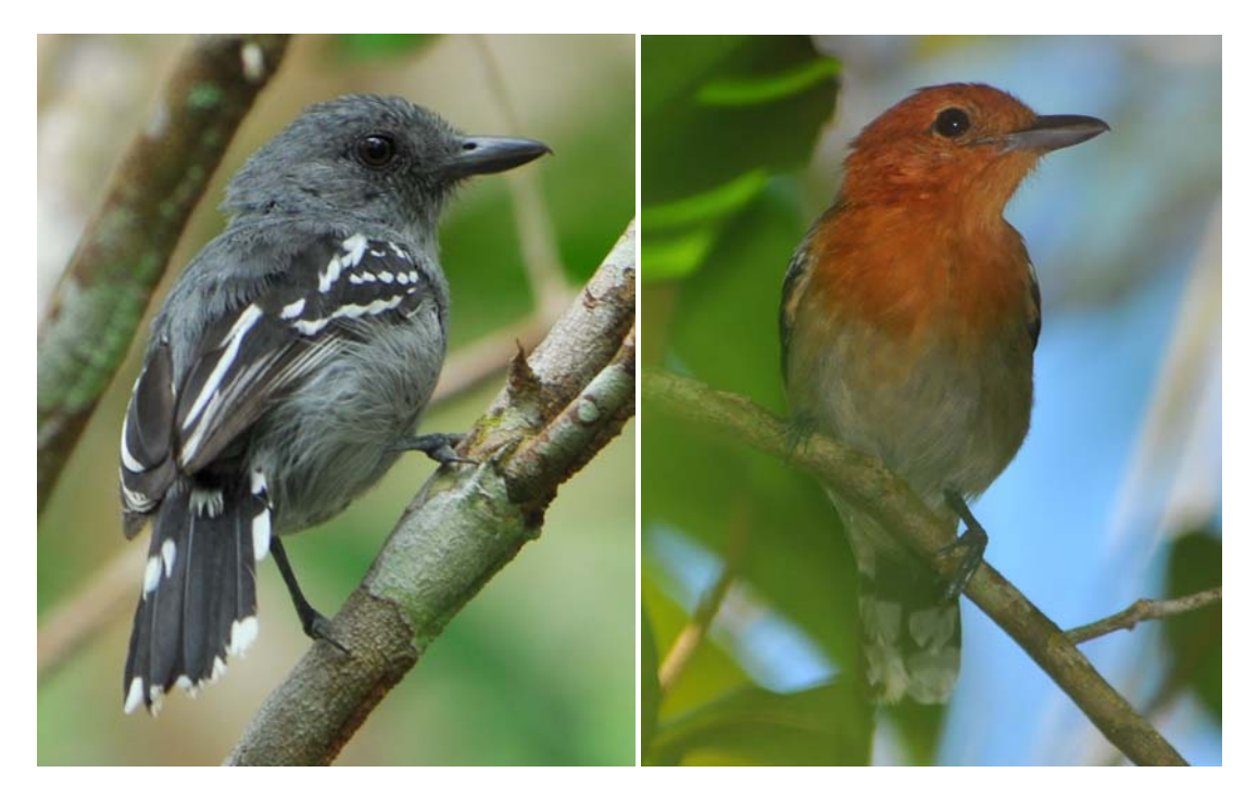
Amazonian Antshrike (male and female) [both in varzea scrub near to Junglaven]

To everyone's surprise, we were spared the long, hot hike back across the savannah by the arrival of the Camani truck, which had indeed been brought to life. Things were looking up! After lunch the truck dropped us back at the savannah/terra firme forest interface so that we could again walk the first sections of the forest, where the clear highlight of a slow afternoon was watching a Tiny Hawk methodically pluck the feathers from a small black and yellow bird (a Yellow-backed Tanager or a Yellow-rumped Cacique?) before flying off with its near naked prey.