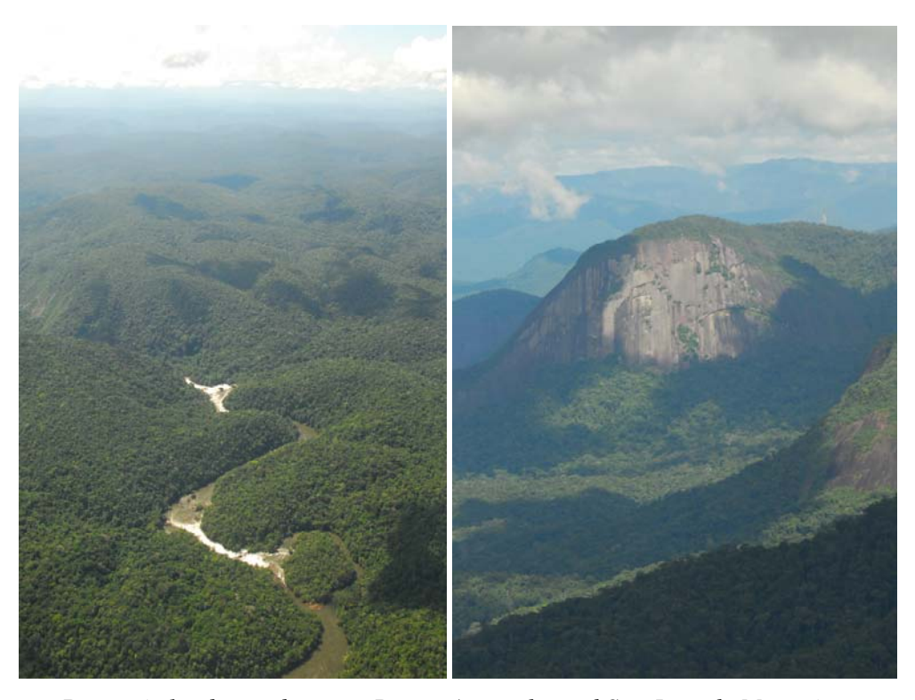
Dramatic landscape between Puerto Ayacucho and San Juan de Manapiare