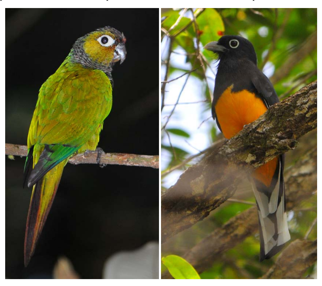
Maroon-tailed Parakeet; Amazonian White-tailed Trogon [both terra firme forest]

Our long day concluded with a scenic but bird-wise largely unsuccessful late afternoon boat trip around the big lagoon (Emma saw an Agami Heron when quietly paddling a dug-out canoe earlier in the day, but the rest of us did not; on the positive side we did all see a male Pompadour Cotinga). We then had a jet-boat like one-hour trip down the Caño Camani and up the Río Ventuari back to the Camani camp.