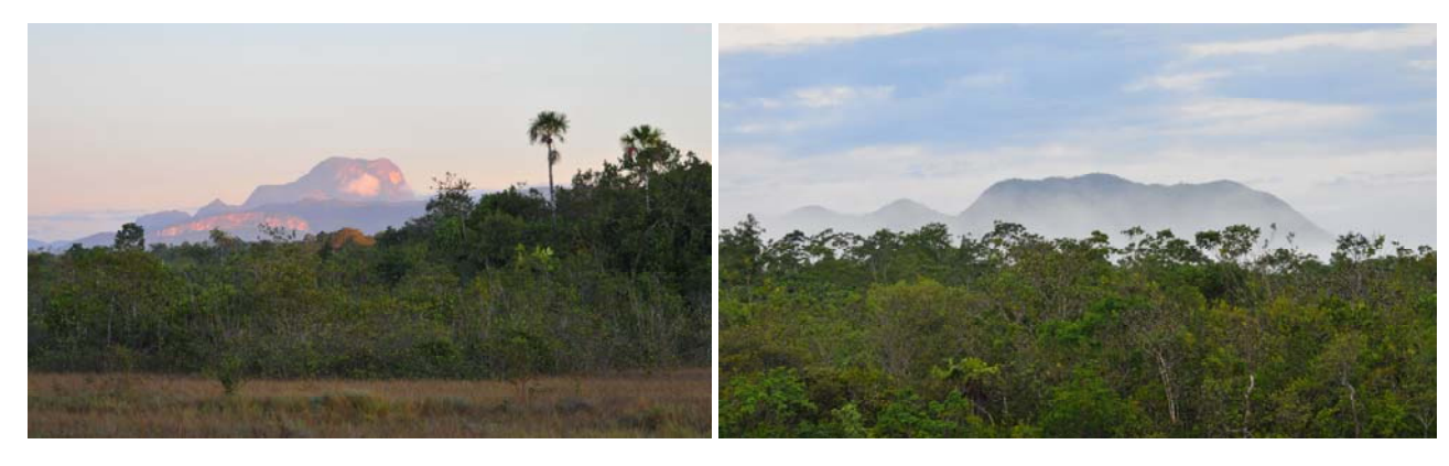
Sunrise over the savannah and white-sand forest; Dawn view across the Junglaven lagoon