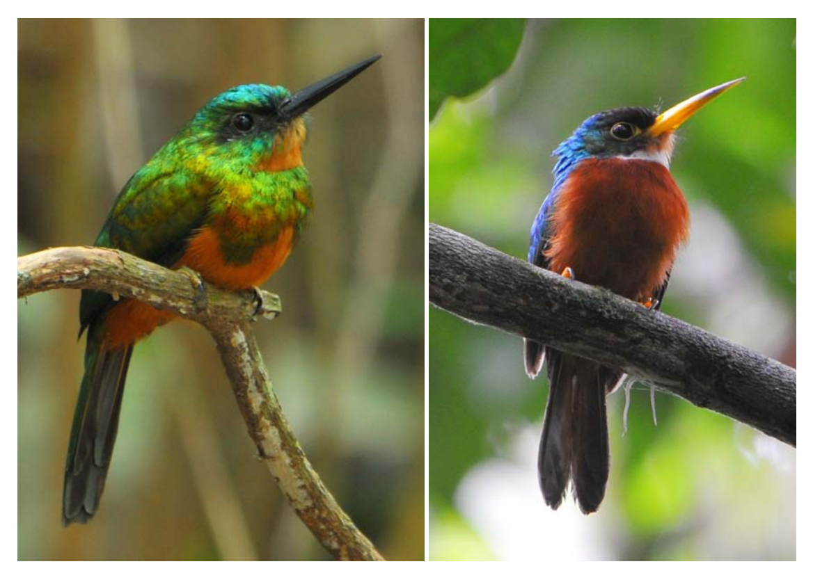
Green-tailed Jacamar (female) [Galapagos trail]; Yellow-billed Jacamar [terra firme forest]

To everyone's surprise, we were spared the long, hot hike back across the savannah by the arrival of the Camani truck, which had indeed been brought to life. Things were looking up! After lunch the truck dropped us back at the savannah/terra firme forest interface so that we could again walk the first sections of the forest, where the clear highlight of a slow afternoon was watching a Tiny Hawk methodically pluck the feathers from a small black and yellow bird (a Yellow-backed Tanager or a Yellow-rumped Cacique?) before flying off with its near naked prey.