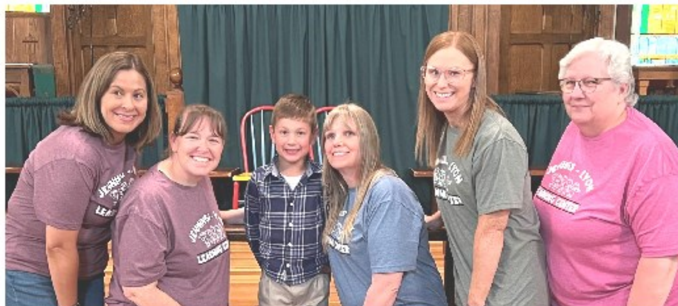
Our preschool teachers and one of our happy graduates!

We loved their songs and answers to interesting questions!