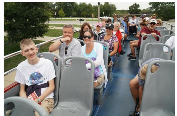
Hop On, Hop Off bus in Chicago