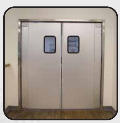
Shown w/ aluminum hinge covers