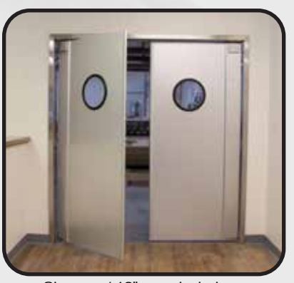
Shown w/ 12" round windows