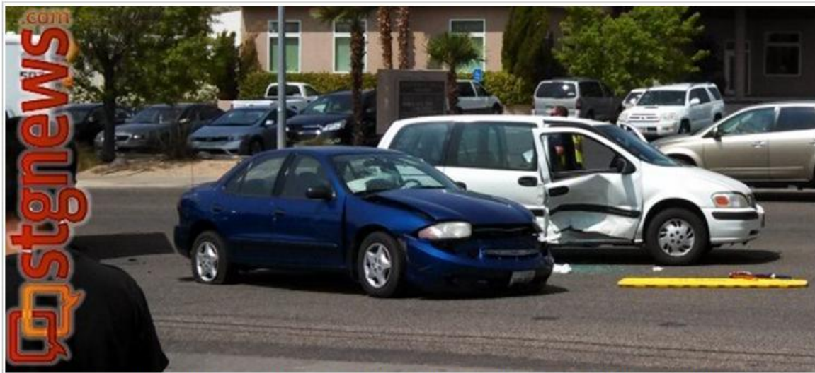
A three-vehicle accident sent two people the hospital and left another with a citation for distracted driving. St. George, Utah, June 3, 2013