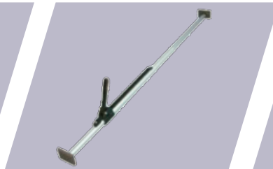
Load Lock Bars