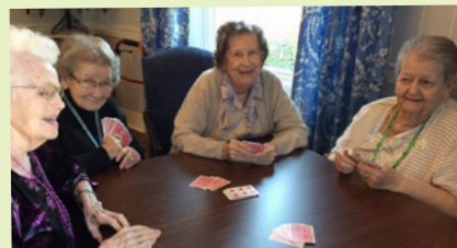
Crazy 8's Card Game was a favorite among residents this winter