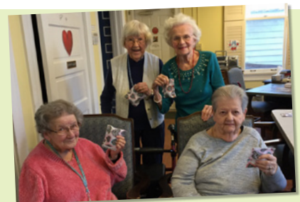
Another resident craft was to make handmade "no-sew" handwarmers.