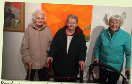
Residents enjoy a trip to the Academy Art Museum in Easton