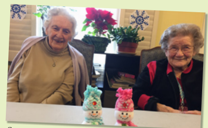
Snowman craft was a hit among residents