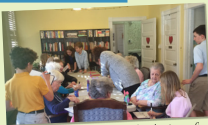
Country School students visit with Valentine crafts