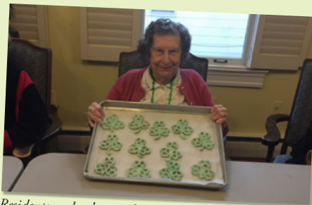
Residents make shamrock pretzels