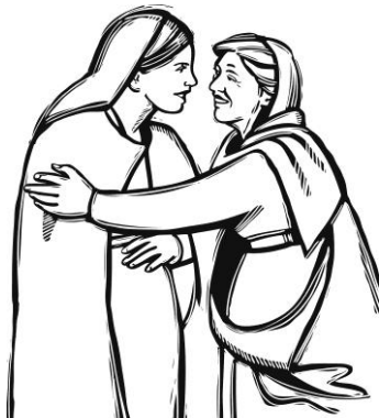
Mary Visits Elizabeth

Copyright © Sermons4Kids, Inc. May be reproduced for Ministry Use