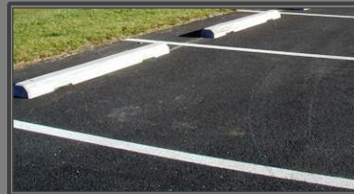
Wheel Stops and Speed Bumps