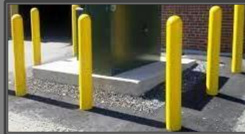
Bollard Installation and Repairs