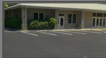
Seal Coating and Line Striping