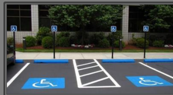
Signage, Stenciling & ADA Compliance