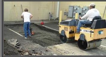
Repairs and Dumpster Pads

Call Today Estimates are Free No Cost É No Obligation