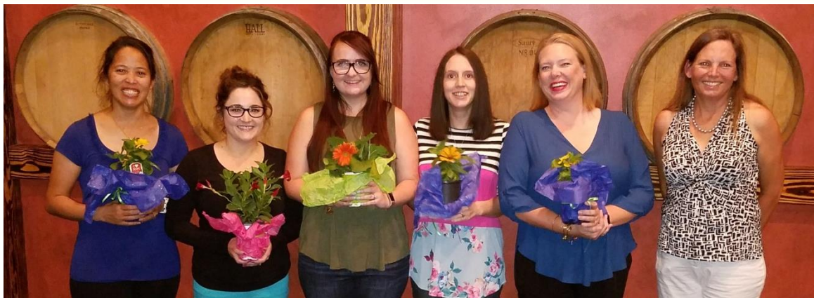
2018-2019 Executive Board (minus our Secretary)

Positions highlighted in yellow denote open positions