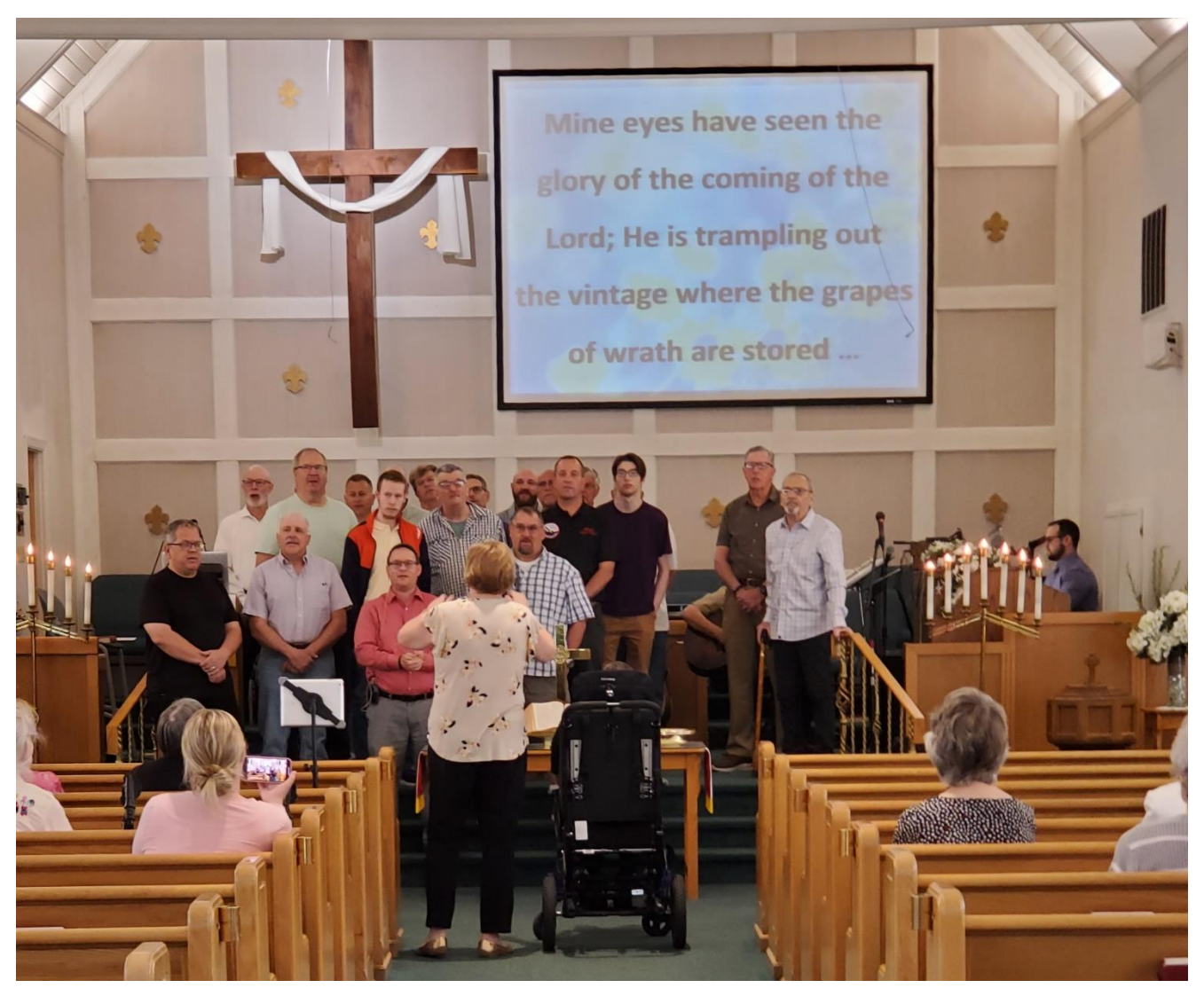
ALWAYS NICE TO HEAR SOME OF OUR MEN SERENADE OUR LADIES FOR MOTHER'S DAY!!