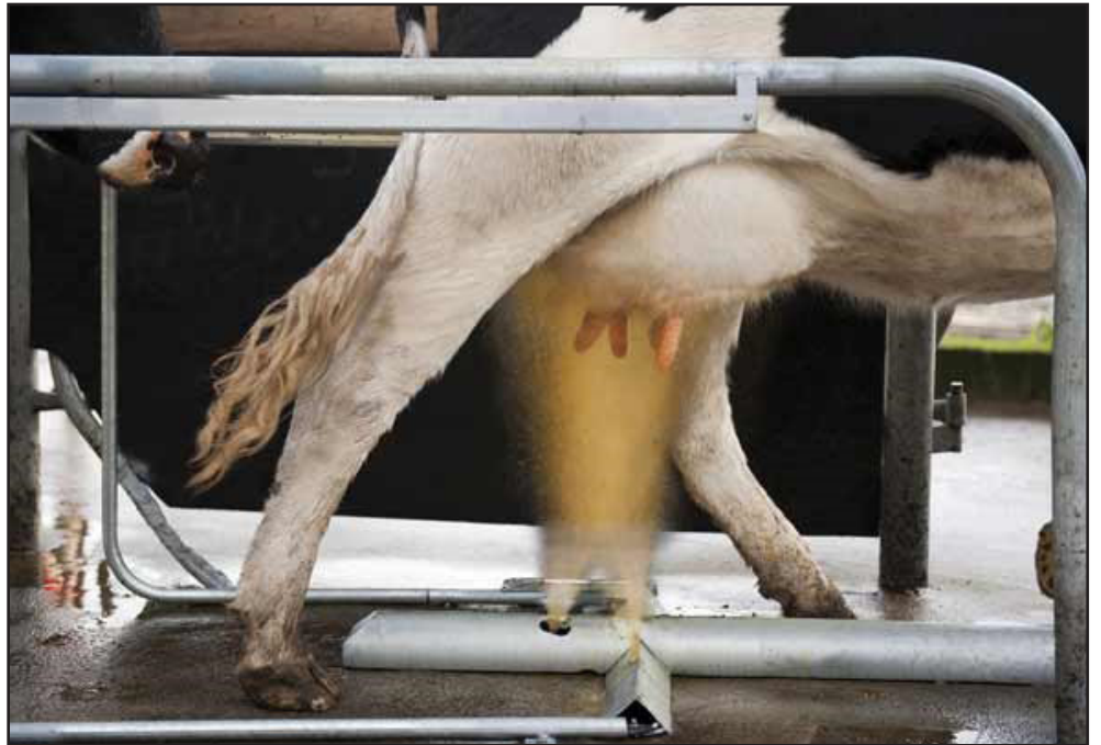
The WETIT QD0 Inline Automatic Teat Dip Sprayer for Pre- and Post-Dipping in Linear Parlors and Pre-Dipping in Rotary Parlors provides proven improvement in herd health.

The QD0 In-line Teat Dip Sprayer may not reduce labor in smaller parlors but it will allow operators more time to do a better job of udder prep and speed up milking. In larger parlors it allows less operators to do a better job of prepping that should result in faster milking thus reducing the total milking time of each group of cows.