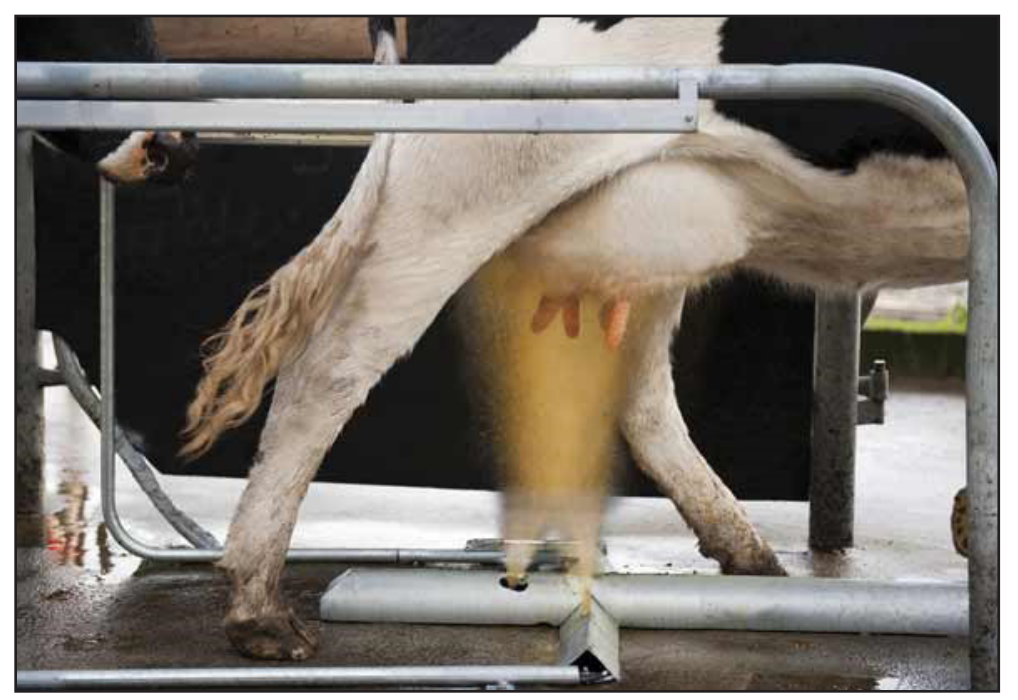
The WETIT QD0 Inline Automatic Teat Dip Sprayer for Pre- and Post-Dipping in Linear Parlors and Pre-Dipping in Rotary Parlors provides proven improvement in herd health.

The QD0 In-line Teat Dip Sprayer may not reduce labor in smaller parlors but it will allow operators more time to do a better job of udder prep and speed up milking. In larger parlors it allows less operators to do a better job of prepping that should result in faster milking thus reducing the total milking time of each group of cows.