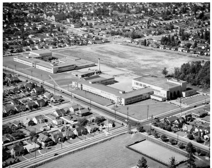
1962 Lester Pearson and Vincent Massey schools. Image taken from New West Record article on November 27, 2020. http://bit.ly/3pr7Sez

NWSSFarewell@sd40.bc.ca by FEBRUARY 26, 2021.