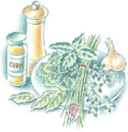
When You Shop for Food

Unlike canned and processed foods, fresh foods have no added salt and are better for you. When you're food shopping: