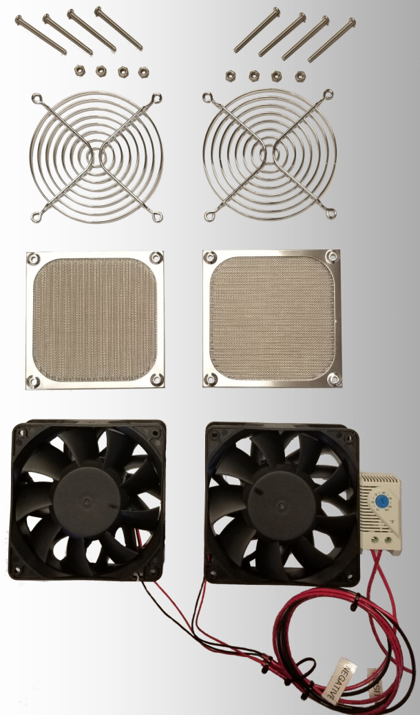
Shown: 24-FK2 Fan Kit with All Material