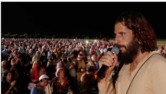
Click image to view the Our Father being prayed in Aramaic.

The second day of shooting included filming in the dark with groups of extras huddled around campfires. When “Cut!” was called for the final time, Roumie asked if he could pray the Our Father for the crowd. In a moving witness to his Catholic faith, he made the sign of the cross and then recited the prayer in Aramaic, the language which Jesus spoke and would have prayed this prayer.