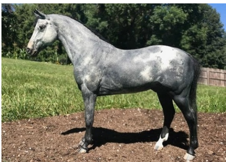
RESERVE CHAMPION STOCK BREED: SUNSHINE'S DARK DELIGHT (SuR)

Arabian (59): 1-Sweet Jane (LD), 2-Mon' Nafa Rani (CR), 3-Sylver Crescent (CM), 4-White Treason (MW), 5-TS Elegant Gypsy (MP), 6-Ahvaz Orashahn (SN), 7-Jamil Mhuratt (CR), 8-Ibn Opium (MW), 9-Fantasy Charisma (SSt), 10-Nusaal (BH), HM-Blue Boy (JW), Isilme (KW)