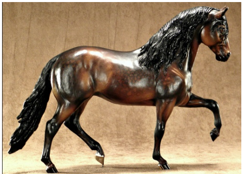
RESERVE CHAMPION SPANISH BREED: MARQUESA (CM)

American Saddlebred (21): 1-20th Century Fox (VM), 2-Capital Genius (HC), 3-Sultan of Swing (JC), 4-Marvelous Marvin (HC), 5-Highland's Captain Jack (NF), 6-Divine Miss M (CR), 7-Kentucky Belle (CR), 8-Keepsake (HC), 9-Autumn Storm (HC), 10-Fall Sunrise (HC), HM-TS Missy Brown (MP)