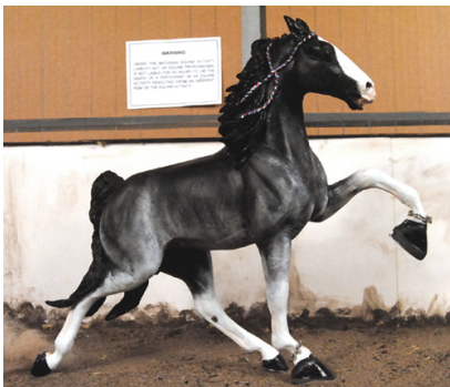
RESERVE CHAMPION GAITED BREED: THE TICK (SSu)

Clydesdale/Shire (18): 1-RM Nuclear Winter (KW), 2-RAS Elian Demoiselle (CM), 3-TS Bonnie Red (MP), 4-Sparrowood Rob Roy (SSu), 5-TS Annie Red (MP), 6-PR Burning Blue Soul (JV), 7-Amazing Heart (SN), 8-Rumneyhill Victoria (SN), 9-D's Hillbilly Hollywood (VM), 10-So JS Trade-off (SuR), HM-CZ Stonehaven Forrestal (JV)