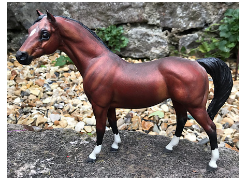
RESERVE CHAMPION BASE COLOR: ROYAL TORRIATTE (LK)

Dapple Grey (54): 1-Gossamer Wings (KW), 2-RM Nuclear Winter (KW), 3-Tonnerre Deveroux (SSu), 4-Tetrassina (KW), 5-La Paska (SSu), 6-Elegy (AI), 7-PR Eldorado Spanish Rose (JV), 8-Camelot's Hot T' Trot (CM), 9-Qalizii (SSu), 10-RAS Elian Demoiselle (CM), HM-TS Pleistocene (MP), Pan Zaretta (JW)