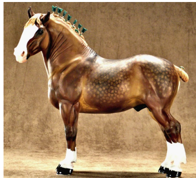
RES. CHAMPION DRAFT BREED: LE COMTE DE MONTE CRISTO (CM)

American Pony (9): 1-Kuato (IC), 2-Speed Trap (AI), 3-TS Sheldon (MP), 4-Joshua II (HC), 5-Ambrosea (CM), 6-DP Reckless (JW), 7-The Buckeye (HC), 8-Pepe Peso (HC), 9-Sam I Am (HC)