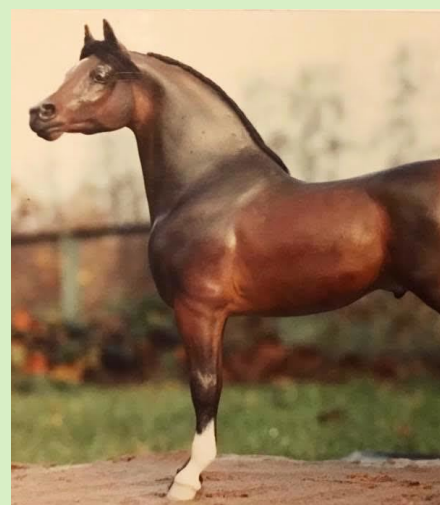
Crabtree Noon Time Spender 35 Years Old!