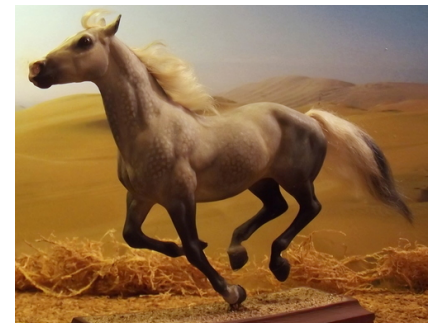
RESERVE CHAMPION REPAINT/HAIR OR SCULPTED MANE/TAI: PAN ZARETTA (JW)