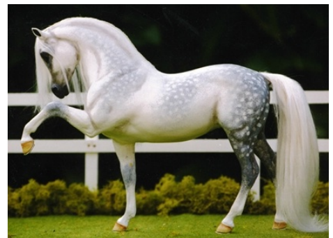
CHAMPION REPAINT/HAIR OR SCULPTED MANE/TAI: PR ELDORADO SPANISH ROSE (JV)

Repaint w/Non-Hair M/T: Smaller than Classic (10): 1-I'm Impressed (SN), 2-MN Jackie O (HC), 3-Romeo (CR), 4-Kitty Sonata (IC), 5-Frosted Gold (CR), 6-Titan (IC), 7-London Fog (LK), 8-Harmonium (LK), 9-CL Fairway (HC), 10-Tiny Bud (HC)