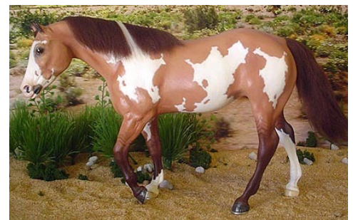
RESERVE CHAMPION PATTERNED COLOR: RUBY HEART (CF)

Longear/Exotic (8): 1-Gallimaufry (SSu), 2-J's Dandyllion (AI), 3-J's Tiger Lily (AI),