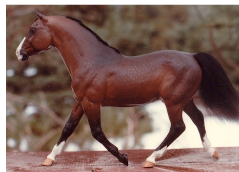
RESERVE CHAMPION SPORT BREED: RM SNAKE PLISSKEN (SuR)

Paso Fino/Peruvian Paso (8): 1-Danzante (AI), 2-Diamond Majestad (CM), 3-Encantador (CM), 4-Trueno Azul (CM), 5-Stephano (JW), 6-Cancion De Amor (AP)