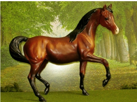
RES. CHAMP CUSTOM W/FACTORY PAINT: FIREO (NF)

Repaint: Trad. or Larger (14): 1-Andro Umeda (SM), 2-Carnival King (LB), 3-Tejas Treasure (VM), 4-*Rebel Bint Sahara (CH), 5-Hi Ho Hastings (LB), 6-Korsakov (CH), 7-Azure Lady (SSt), 8-Disco Par T (IC), 9-Poco Graybar (LB), 10-Sheneyn Alar (CH), HM-Candee (CF)