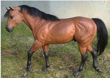
CHAMPION STOCK BREED: DESERT MEDALLION (RN)

Other Pure/Mixed Stock Breed (7): 1-Moonlight Drive (LK), 2-DQ Storm Warning (SSt), 3-Bourbon Express (SSu), 4-Montana Cat (LB), 5-The Cimarron Kid (JV), 6-Nabinabah The Bruce (CM), 7-MJW Golden Nugget (ShR)