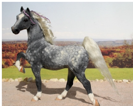
RES. CHAMPION FLOCKED/ OTHER CUSTOM: TS CENOZOIC SILVER MORNING GLORY (MP)