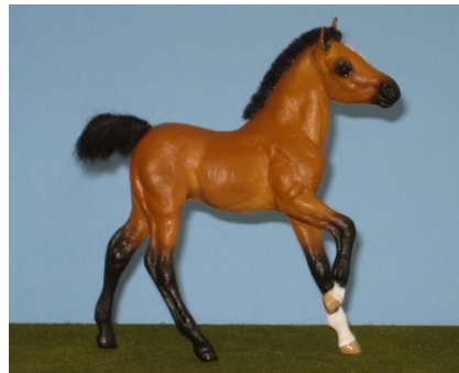
RESERVE CHAMPION CREAM/DUN COLOR: PREMIO (NF)

Blanket Appaloosa (39): 1-Mighty Bright J (AI), 2-J's Enchanted Ecco (AI), 3-DQ Storm Warning (SSt), 4-The Paisley Palette (ShR), 5-Murphy's Law (AP), 6-Cloak Of