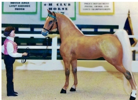
RES. CHAMPION GAITED BREED: SO SUPREMEPLY FANCY (AI)

Clydesdale/Shire (12): 1-Foxcroft Lad (LK), 2-Sparrowood Beauty (SSu), 3-Dominion Blue Douglas (SSu), 4-Lady Of Trieste (CM), 5-Royal Scam (LK), 6-Royal Witch (AP), 7-Diamond Blue Rose (CR), 8-Northrigg Sable (VM), 9-Barron's Burdon Belle (JV), 10-Cedar Hill Duncan (VM), HM-Castlekeep Mistress (LB)