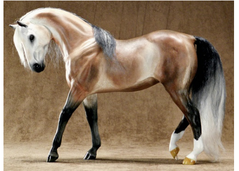
CHAMPION SPANISH BREED: MALEGENA (CM)

Other Pure or Mixed Spanish Breed (9): 1-Malegena (CM), 2-Elusive Vision (SS), 3-TS Picante (MP), 4-Encaje (SS), 5-Estela (VM), 6-PR Bosanova Brief Encounter (JV), 7-Ice Queen (AI), 8-KT Danza De Oura (CM), 9-Lucullian (HC)