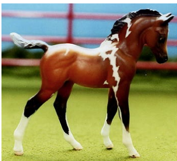
RESERVE CHAMPION CUSTOM WITH FACTORY PAINT: FAIRUZA (AP)

Repaint: Traditional or Larger (26): 1-Brimstone (JC), 2-Sparkling Chablis Z (CM), 3-Breezen (AI), 4-Moon Dance (VM), 5-Come Fly With Me (CC), 6-Poco Skybar (RN), 7-Kentucky Bugaboo (SSu), 8-Blue Silk Rose (IC), 9-RythmMaster