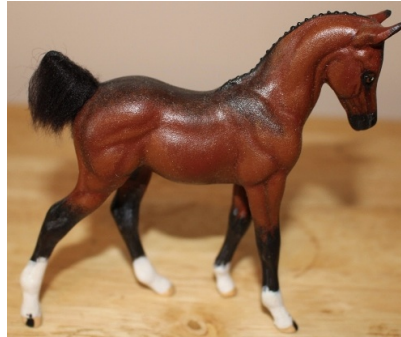
CHAMPION FLOCKED/OTHER CUSTOM: ANTARA APPALONIA (LB)

Hollywood Amber Lad (IC), 3-Carosel (HC), 4-*Ardiente (CH)