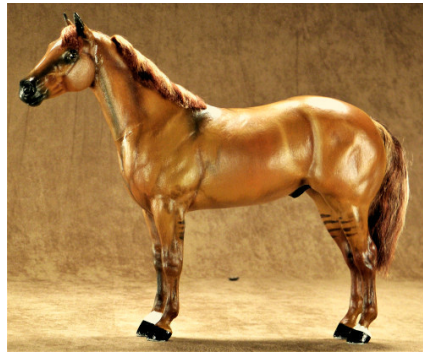
CHAMPION CREAM/DUN COLOR: KID'S SPANISH CASH (CM)

Dun/Grulla (9): 1-Kid's Spanish Cash (CM), 2-Miss Smokum Royal (CM), 3-Mito's Something Wicked (SSu), 4-Buttercup (NF), 5-Little Smoky (CF), 6-Confederate Gray (LB), 7-Seven S Rebel (LB), 8-Desert Medallion (RN), 9-Althea (ShR)