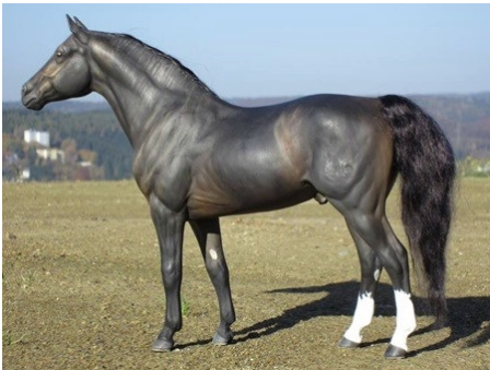
CHAMPION SIMPLE REMAKE/REPAINT/HAIR OR SCULPTED MANE/TAIL: AMANTUS VS (SN)

Simple Remake & Repaint with Non-Hair Mane/Tail: Smaller than Classic (9): 1-Skip Mount (RN), 2-Ice Queen (AI), 3-Meghan's Hope (SSt), 4-Ziggy (HC), 5-ZI Jedi Jetta (AI), 6-Autumn Storm (HC), 7-Shales Sassy Miss (IC), 8-McQueen (LK), 9-Marlayna (ShR)