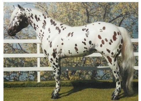
RESERVE CHAMPION STOCK BREED: POCO DOT (IC)

Arabian (61): 1-Gossamer Wings (KW), 2-So China Rose (SuR), 3-KAS Dream Dancer (BH), 4-Ahvaz Gazah (SH), 5-Gwalizein (JW), 6-Hathor (SN), 7-Heaven's Angel (SH), 8-Walad (SN), 9-GGK Tiqatu (SN), 10-TC (CM), HM-Maamoon Azeem (SH), Tech Noir II (AI)