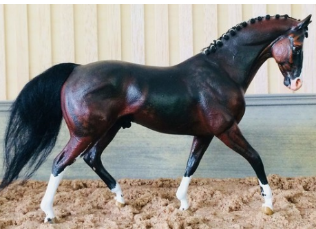
RESERVE CHAMPION SPORT BREED: IN THE DARK (ShR)

Paso Fino/Peruvian Paso (10): 1-Marquesa (CM), 2-Me Bolido El Pastor (JW), 3-Huaricanga (KW), 4-LJ Abricotine Bleu (JV), 5-TS Jalapeno (MP), 6-Raven (HC), 7-Tesoro D Oro (JW), 8-PR Balenciaga Brio (JV), 9-TS Crystal Conchita (MP), 10-Lad Amigo (HC)