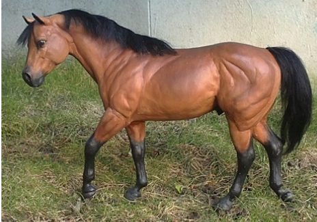
CHAMPION EXTREME REMAKE/REPAINT/HAIR OR SCULPTED MANE/TAIL: DESERT MEDALLION (RN)

Extreme Remake & Repaint with Non-Hair M/T: Smaller than Classic (3): 1-DQ April Whisper (SSt), 2-Queen's Gambit (JC), 3-LL Tidal Wave (SM)