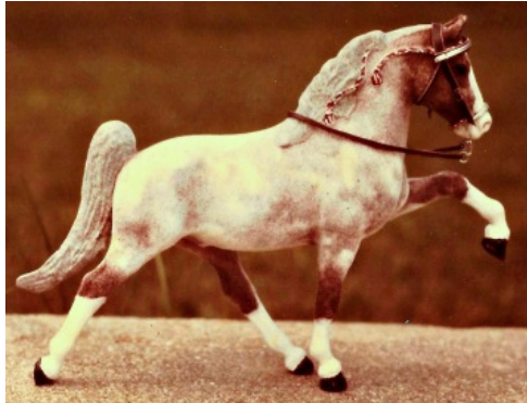
Gone But Not Forgotten: Vintage customs that no longer exist

Gaited Breed (1): 1-Roaring Roan (CM) [pictured at top of next column]