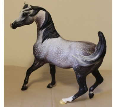
photo services, Tulyaram was shipped off and duly returned with amazing close-up photos for Halter as well as English and Western pleasure. I am still hunting and hoping for those negatives... Thank you to the entire VCMEC crew for this opportunity to show him again!"