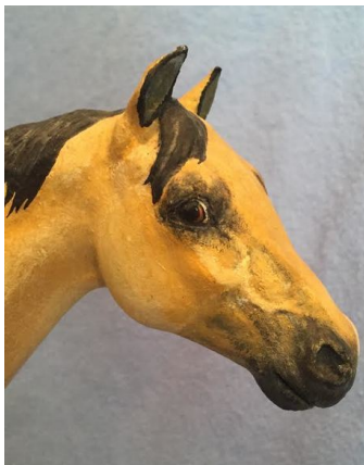
Here's a jaunty Breyer Stud Spider customized by