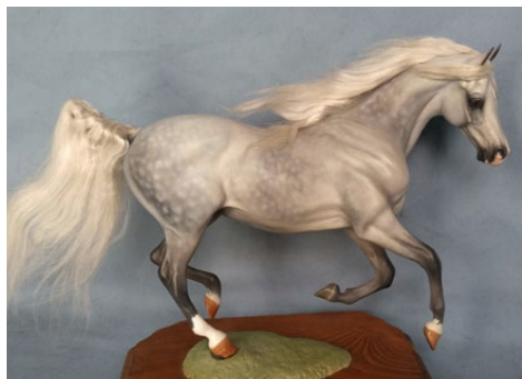
RESERVE CHAMPION EXTREME REMAKE/REPAINT/HAIR OR SCULPTED M/T: GOSSAMER WINGS (KW)

Flocked w/Flocked M/T and Remade & Flocked w/Flocked M/T: no entries