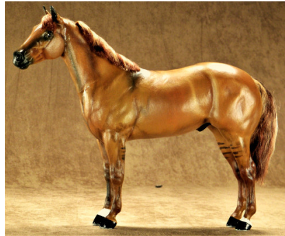
RES. CHAMPION SIMPLE REMAKE/REPAINT/HAIR OR SCULPTED MANE/TAIL: KID'S SPANISH CASH (CM)

Major Remake & Repaint w/Hair M/T: Trad. or Larger (67): 1-Sweet Jane (LD), 2-Sunshine's Dark Delight (SuR), 3-Boardwalk Jack (SSu), 4-Jamil Mhuratt (CR), 5-Hollywood Starlette (CM), 6-RM Snake Plissken (SuR), 7-Spider Ice (ShR), 8-Dakota Shyster (LB), 9-SKS Aristo Khat (CM), 10-Quita Cowboy (SSu), HM-Lady Love (LB), *So Viktor Alexi (SuR)