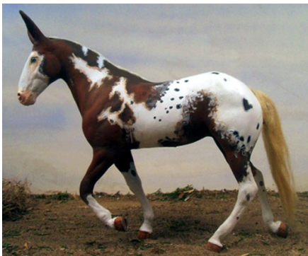
RESERVE CHAMPION OTHER COLOR: GALLIMAUFRY (SSu)

1980s COLOR DIVISION OVERALL CHAMPION: MATT HOUSTON (JC)