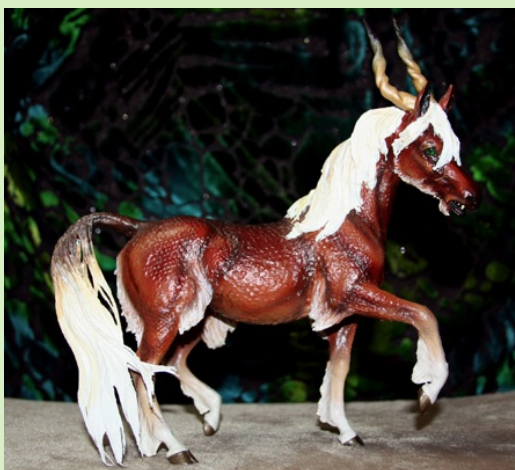
Hikaze 30 Years Old!