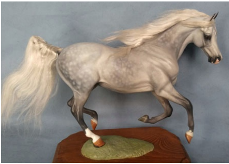
CHAMPION LIGHT BREED: GOSSAMER WINGS (KW)

Other Pure or Mixed Light Breed (7): 1-LJ Hit It Hal (SM), 2-Red Hawk (SS), 3-TS Desert American Queen (MP), 4-KT Bunduki (RN), 5-Carolina Girl (SS), 6-Dream Theater (ShR), 7-PR Malika Siglavia (JV)