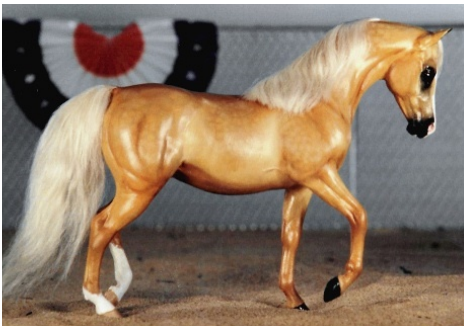
RESERVE CHAMPION LIGHT BREED: SKS MYSTIC AURA (CM)

Thoroughbred (30): 1-In The Dark (ShR), 2-Makers Mark (LD), 3-Tetrasina (KW), 4-Royal Torriatte (LK), 5-Sun's Ask For Me (SN), 6-Super Trooper (JV), 7-Temple Lord (SN), 8-WBP Aristocratic Heir (IC), 9-Half A Shadow (SN), 10-Cry Dream (SN), HM-Katana (SN)