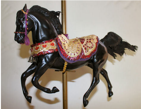
CHAMPION OTHER COLOR: THE SCEPTER (HC)

Fantasy Color (2): 1-The Scepter (HC), 2-Carosel (HC)