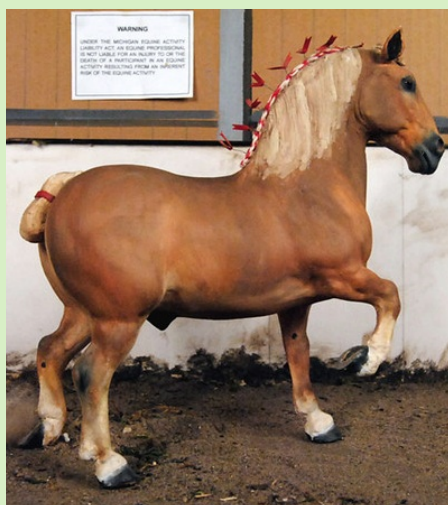
Joshua Jinx 40 Years Old!