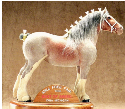
RES. CHAMP FLOCKED/OTHER CUSTOM: LADY OF TRIESTE (CM)

1980s WORKMANSHIP DIVISION OVERALL CHAMPION: ARAHAEL (LB)