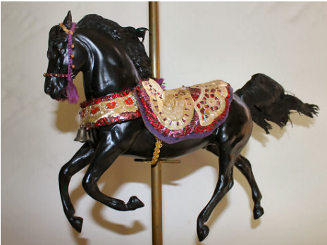
RES. CHAMPION EXTREME REMAKE/REPAINT/HAIR OR SCULPTED M/T: THE SCEPTER (HC)