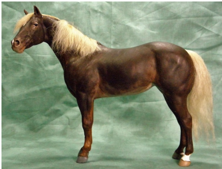
RESERVE CHAMPION STOCK: CUTTER'S POKEY PINE (CM)

Arabian (21): 1-Ibn Hotep (SSu), 2-An-calime (KW), 3-*The Raisuli (CH), 4-Nhi Vanye I Chyya (LB), 5-AI Ouisha (SN), 6-Jeddak's Rose (CH), 7-*Rebel Bint Sahra (CH), 8-Maiika (SSu), 9-Dragon-quest's Desert Rose (SSu), 10-Fireo (NF), HMs-Dark Desire (SSu), Andro Umeda (SM)