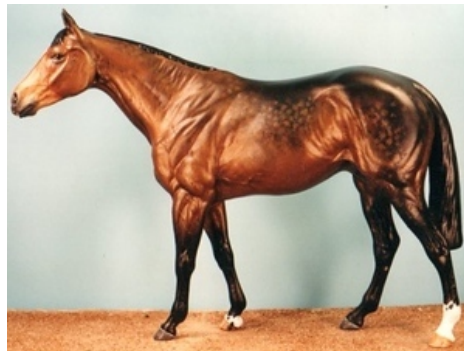
CHAMPION REPAINT: BRIMSTONE (JC)

Repaint: Smaller than Classic (43): 1-Blackberry Lane Notorious (ShR), 2-Encaje (SSt), 3-Hoop De Do (IC), 4-Spoiler (RN), 5-Fair Isle (LK), 6-Blackberry Lane Sunlight Revel (ShR), 7-Blue Out My Flip Flop (IC), 8-Maximum Domination (IC), 9-General Command (CC), 10-ST Street Maniac (HC), HM-Koncarlaet Leona (CM)