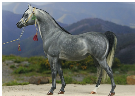
RESERVE CHAMPION LIGHT BREED: MON'NAFA RANI (CR)

Thoroughbred (25): 1-Matt Houston (JC), 2-Spider Ice (ShR), 3-Foolish Pleasure (JC), 4-Lights Out (JC), 5-Classic Girl (LD), 6-Winterfell (KW), 7-Slew O' Bucks (SSu), 8-Sun's Quatsch (SN), 9-Phantom Wolf (ShR), 10-Eris (LB), HM-Risque Business (KW)