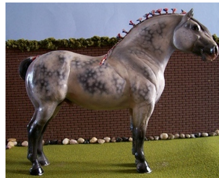
RESERVE CHAMPION DRAFT BREED: LEGACIAM (IC)

American Pony (17): 1-The Paisley Palette (ShR), 2-DQ Butterscotch Brandy (AP), 3-Confederate Gray (LB), 4-Marshall Cody (LB), 5-Quicksilver (JC), 6-BBG's Silver Ghost (CM), 7-TS Sheldon (MP), 8-DQ Starsparkle (AP), 9-Lambchop (LD), 10-Juliette (HC), HM-Zip's Diamond Jim (CM)