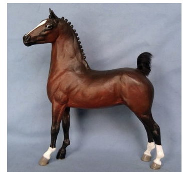
RES. CHAMPION MAJOR REMAKE/REPAINT/HAIR OR SCULPTED MANE/TAIL: SO CAPTIVATED (KW)

Extreme Remake & Repaint with Hair Mane/Tail: Trad. or Larger (70): 1-Desert Medallion (RN), 2-Matt Houston (JC), 3-Grey Mercedes (SSu), 4-Rheingold (RN), 5-Foxcroft Lad (LK), 6-Rastaman (BP), 7-Sylver Crescent (CM), 8-White Treason (MW), 9-Rustler Ridge (RN), 10-Alamitos Ridge (RN), HM-Apollo (SH), Tonto Bars Hank (VM)