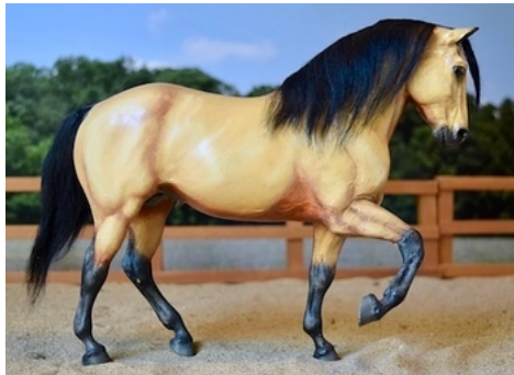
RESERVE CHAMPION SPANISH BREED: DANZANTE (AI)

ASB (19): 1-Grey Mercedes (SSu), 2-Dark Commander (CH), 3-Black Tie Affair (SSt), 4-Crimson Queen (ShR), 5-Diamond Sun-gold (AP), 6-Highland Heartbreaker (SSu), 7-Business As Usual (HC), 8-Personal Effects (LD), 9-DQ's Razzle Dazzle (IC), 10-DW Interpretation (HC), HM-Prince Of Denmark (SSt)