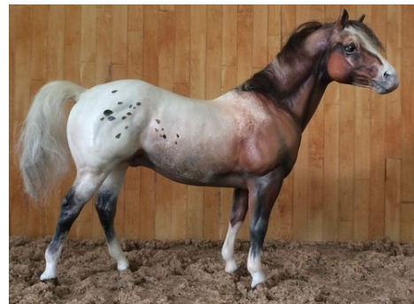
CHAMPION PONY/MINIATURE HORSE: THE PAISLEY PALETTE (ShR)

Other Pure or Mixed Pony Breed (9): 1-Tug Hill Pied Piper (CM), 2-Althea (ShR), 3-Parkland Spartan (SH), 4-Tug Hill Minstrel (CM), 5-Big Bang Theory (ShR), 6-Southern Cross (CM), 7-The Country Girl (LK), 8-Dante's Inferno (HC), 9-Twylands Coral Sea (SH)