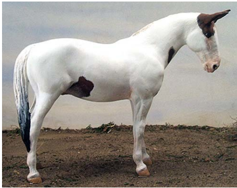
RESERVE CHAMPION LONGEAR/ EXOTIC/FANTASY: DEMETER (SSu)

Stock Breed Foal (16): 1-Impressive Lady (CS), 2-The Kryptonite Kid (IC), 3-Angel (LB), 4-Poco Skybar (RN), 5-Spy Games (JC), 6-Wind Charm (JW), 7-LJ September Skye (JV), 8-Luna Halo (AI), 9-Jettster (AI), 10-PR Saskatoon Blues (JV), HM-O Shez Sucha Brat (IC)