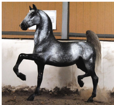
CHAMPION GAITED BREED: GREY MERCEDES (SSu)

Other Pure or Mixed Gaited Breed (2): 1-Taxi Dancer (SSu), 2-Mr. Majestic (SSt)