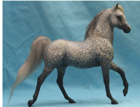
CHAMPION LIGHT BREED: IBN HOTEPE (SSu)

Other Pure or Mixed Light Breed (3): 1-Tulyaram (NF), 2-Candee (CF), 3-Razelle (AP)