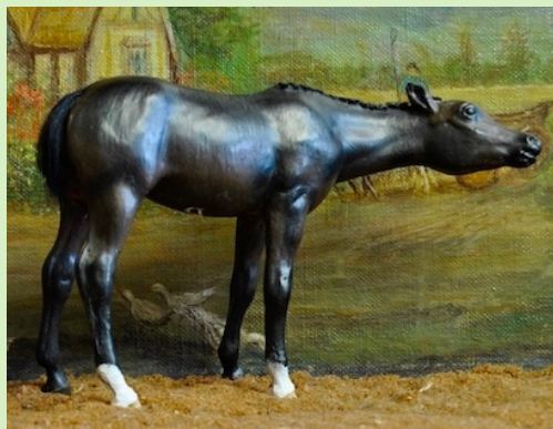
KS Jersey Girl 45 Years Old!