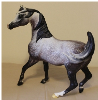
CHAMPION REPAINT: ARAHAEL (LB)

Repaint: Smaller than Classic (13): 1-Evenstar (ShR), 2-Amarna Quimar (MW), 3-Big Bang Theory (ShR), 4-Charisma (CC), 5-Dexi's Midnight Runner (SSu), 6-Khrystal Music (CH), 7-En Fuego (CR), 8-Ravyn (SSt), 9-Sugar N Spice (JP), 10-Tanzer (CH), HM-No Limitz (SH)