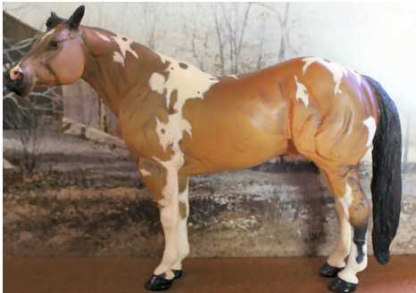
CHAMPION CUSTOM WITH FACTORY PAINT: SERGEANT PEPPER (HC)

Retouch/Partial Paint Removal/Etch on Factory Paint w/Non-Factory Mane/ Tail and Remake and Retouch/Partial Paint Removal/Etch on Factory Paint w/Non-Factory Mane/Tail: none