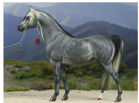
CHAMPION REPAINT/HAIR OR SCULPTED MANE/TAIL: MON'NAFA RANI (CR)

Repaint w/Non-Hair Mane/Tail: Smaller than Classic (2): 1-J's Sweetbriar (AI), 2-DQ's Razzle Dazzle (IC)