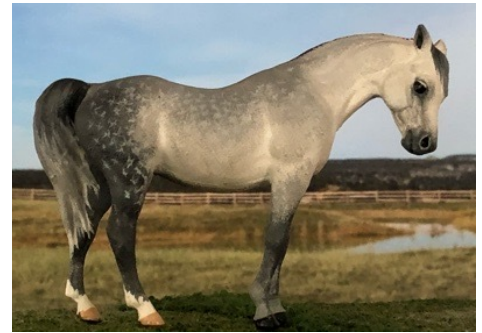
RESERVE CHAMPION REPAINT: EVENSTAR (ShR)

Repaint with Hair M/T: Trad. or Larger (55): 1-Mon'Nafa Rani (CR), 2-Ruby Heart (CF), 3-Smoke Bar Syndicate (CC), 4-TS Elegant Gypsy (MP), 5-Foxy's Image (NF), 6-LL Big Gunz (HC), 7-Mighty Bright J (AI), 8-Encantador (CM), 9-Fantasy Charisma (SSt), 10-Classy Chassis (SSu), HM-Pop Tart (JW), Sheherezade (SH)