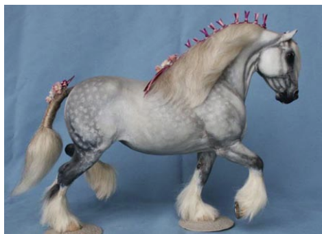
CHAMPION EXTREME REMAKE/REPAINT/HAIR OR SCULPTED MANE/TAIL: RM NUCLEAR WINTER (KW)

Extreme Remake & Repaint w/Non-Hair Mane/Tail: Smaller than Classic (8): 1- Wellsley (HC), 2-Alter Ego (ShR), 3-Carolina Girl (SSst), 4-Creamsicle (HC), 5-Falconleigh (JC), 6-Winter Solstice (ML), 7-Talula (ShR), 8-Kimba (LK)