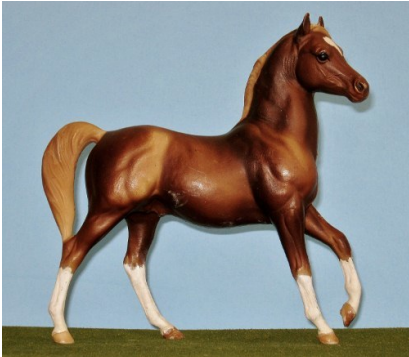
CHAMPION CUSTOM W/FACTORY PAINT: TULYARAM (NF)

Remake and Retouch/Partial Paint Removal/Etch on Factory Paint with Non-Factory Mane/Tail: no entries