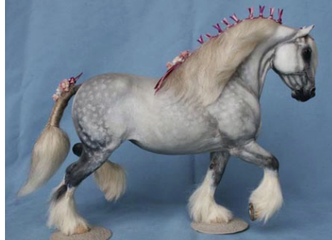
CHAMPION DRAFT BREED: RM NUCLEAR WINTER (KW)

Rouge (JV), 4-WBP Lean On Me (IC), 5-Die Rosenkavalier (JV), 6-WV Heza KO (HC), 7-TS Druid Allanon (MP), 8-Pippilotta-Elmar (JV), 9-TS Lady Leeward Gem (MP), 10-Ridley (LK), HM-Blue Light Special (SSu)