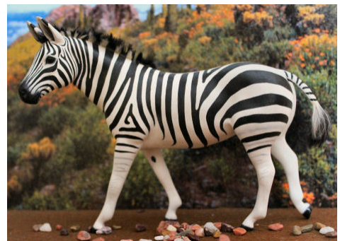
CHAMPION LONGEAR/EXOTIC/FANTASY: ZAMUNDA (HC)

Fantasy Equine (2): 1-TS Ramoth of Riell (MP), 2-TS Trueheart (HC)