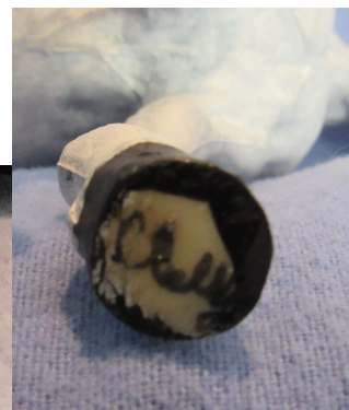
These photos show each type of Linda's signatures on the sole of a hoof, with the date--in this example, (19)80--on another hoof.