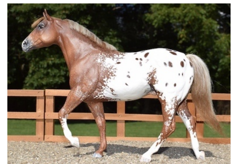
CHAMPION PATTERNED COLOR: MIGHTY BRIGHT J (AI)

Other Pinto Patterns (50): 1-Ruby Heart (CF), 2-Rosalia (RN), 3-Tonto Bars Hank (VM), 4-Peppy Playboy (CMS), 5-LL Big Gunz (HC), 6-Risque Business (KW), 7-Splasha Red (CM), 8-Red Cloud (SSt), 9-Jetarebel (LD), 10-Dexi's Midnight Runner (SSu), HM-J's Party Doll (CM), Cowboy (JW)