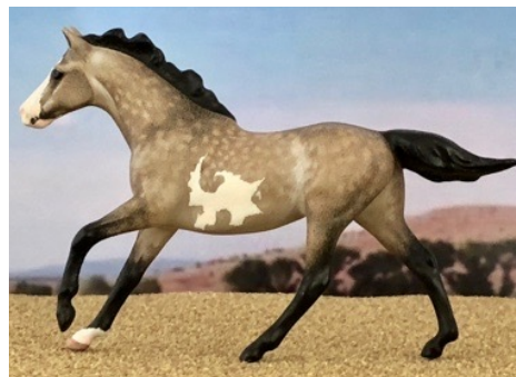
RESERVE CHAMPION REPAINT: BLACKBERRY LANE NOTORIOUS (ShR)