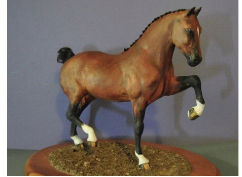
CHAMPION SPORT: BIRCHWOOD GEISHA BOY (BP)

Other Pure or Mixed Sport Breed (2): 1-Wing'd Jaguar (SSu), 2-Flashover (SSu)