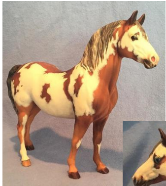
This is Austin City Limits, a stunning "partial repaint" of a Hagen-Renaker chestnut San Dimas Lippet Morgan stallion