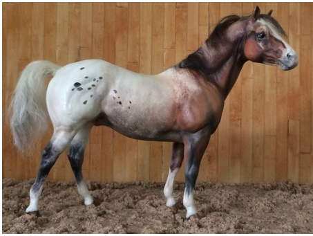
RESERVE CHAMPION REPAINT/HAIR OR SCULPTED M/T: THE PAISLEY PALETTE (ShR)

Simple Remake & Repaint w/Hair Mane/Tail: Trad, or Larger (81): 1-Kid's Spanish Cash (CM), 2-Apache Red Chief (CM), 3-J's Enchanted Ecco (AI), 4-Valentino (CH), 5-Althea (ShR), 6-Beautiful Noise (LD), 7-Murphy's Law (AP), 8-Red Cloud (SSt), 9-Moonlight Drive (LK), 10-Lukachukai (KW), HM-J's Party Doll (CM), RAS Navajo Dove (CM)