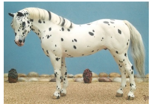
RES. CHAMPION PONY/MINI HORSE: KUATO (IC)

Longear (18): 1-Demeter (SSu), 2-Tulpe (HC), 3-Rebel Yell (RN), 4-Jeb (SSu), 5-MN Elwood Blues (RN), 6-Shamrock Elf-in Magic (SSt), 7-123 (HC), 8-Alter Ego (ShR), 9-DA Bardigano Honest John (JV), 10-Slightly Scarlett (HC), HM-Joshua (SSu)