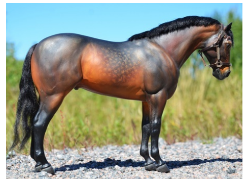
CHAMPION STOCK BREED: R. POCO LEO CHEX (SN)

Other Pure or Mixed Stock Breed (5): 1-WBP Cinco de Oro (IC), 2-RumbleRex (SM), 3-DO Dun IV (JV), 4-Tug Hill Pokey Dott (CM), 5-Ruby Tuesday (ShR)