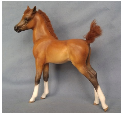
RESERVE CHAMPION FOAL: FLIRTACIOUS (KW)

1990s BREED DIVISION OVERALL CHAMPION: AMANTUS VS (SN)