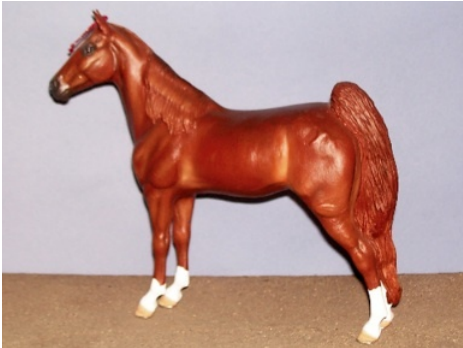
CHAMPION GAITED BREED: 20TH CENTURY FOX (VM)

1-Foxy Moonshine (CM), 2-Lighten Up Jack (HC), 3-Sparkling Chablis Z (CM), 4-TS Autumn Nor'easter (MP), 5-TS Galilean Dragoness (MP), 6-Thumbs Up (HC), 7-PopRocket (HC), 8-Ima Travelin' Man (CM), 9-Hit The Switch (SSu), 10-Glitters Like Gold (JV)