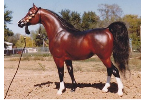
CHAMPION MAJOR REMAKE/REPAINT/HAIR OR SCULPTED MANE/TAIL: SWEET JANE (LD)