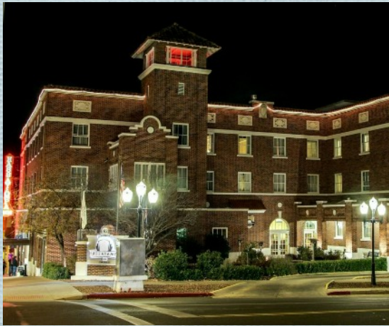
Lunch at the Hassayampa Inn .