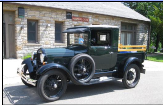
2015 Colorado National Meet