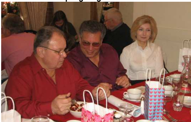
Can I have some?