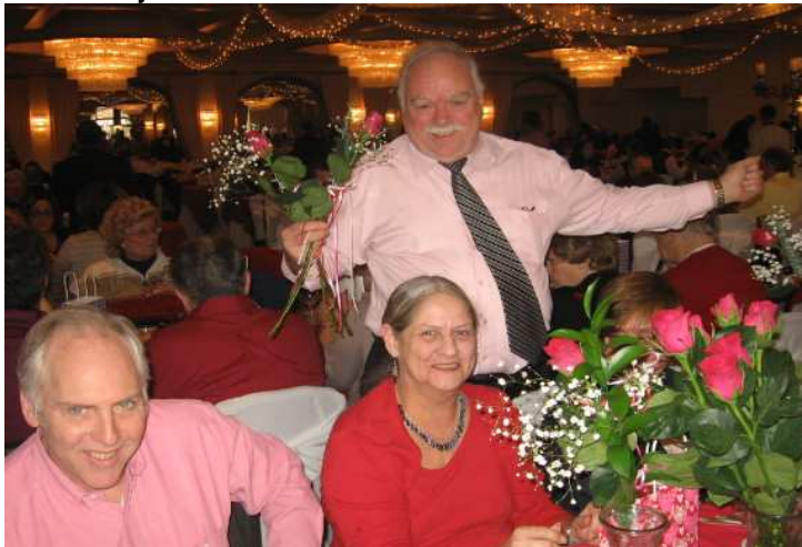
Cupid giving out roses