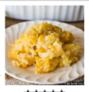
4.62 from 1968 votes