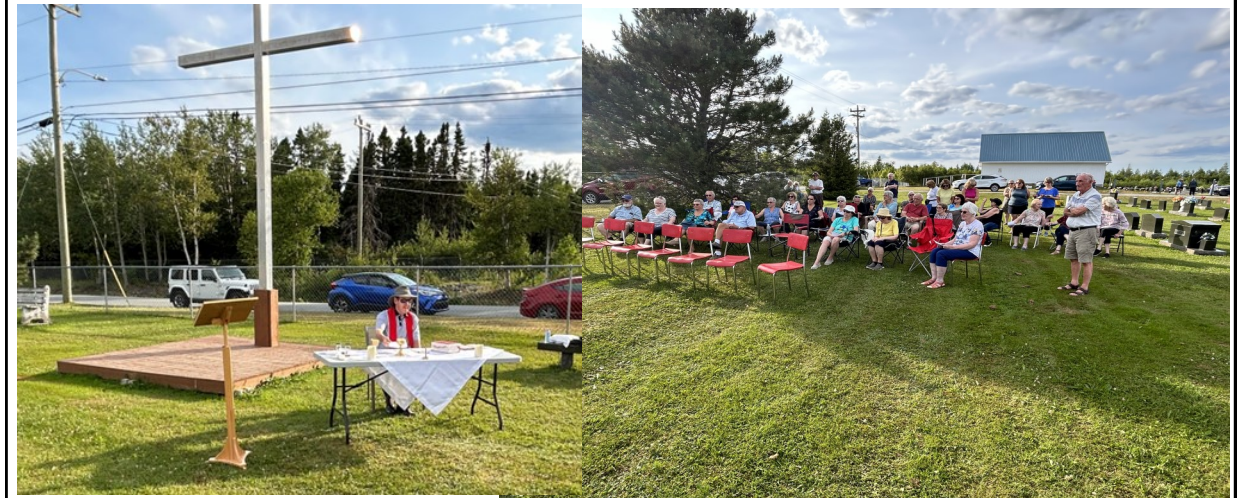
The Annual Cemetery Mass was held at All Saint's Cemetery on Thursday, July 25th.

OFFERTORY ENVELOPES - If you are new to the parish or you do not have offertory envelopes and would like to, please contact the Parish Office at 256-3151 and a box will be provided for you. The parish offers DIRECT DEPOSIT for contributions and accepts E-TRANSFERS .