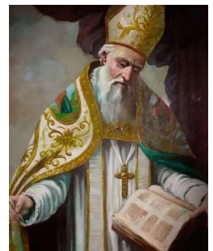
Feast Day: June 28