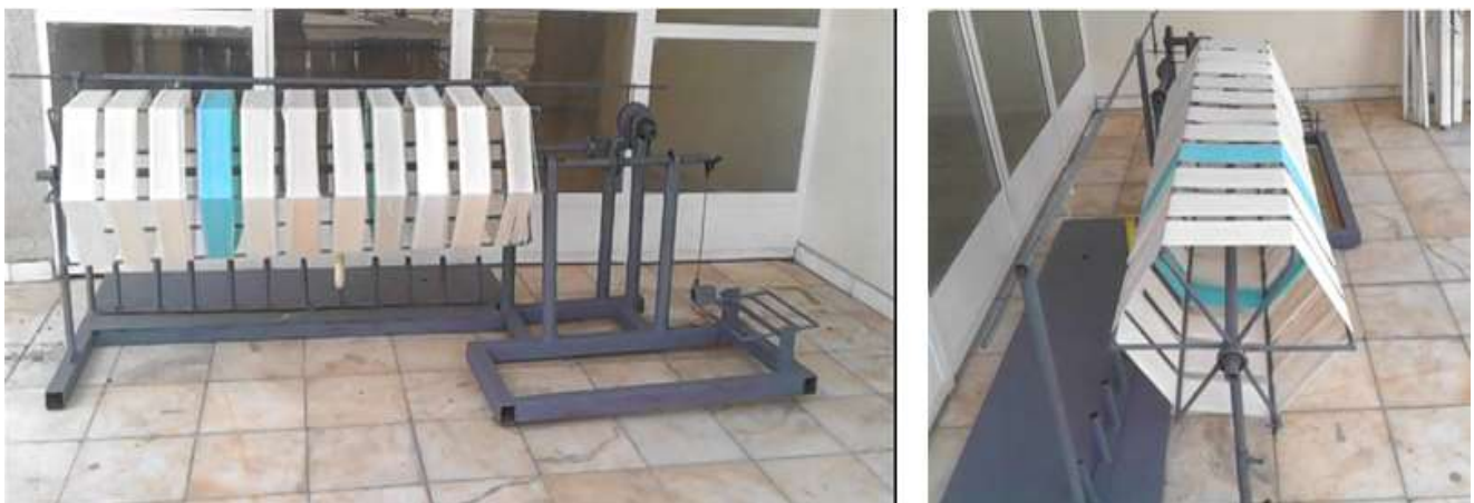
Fig. 2. Front and side view of fabricated manual hank reeling machine

requires one operator and requires simple maintenance. It can wind 12 hanks with one reeling cycle. As indicated in Fig. 2, fabricated manual hank reeling machine can be driven easily by foot like sewing machine treadle. The machine has 80 circumference reels.