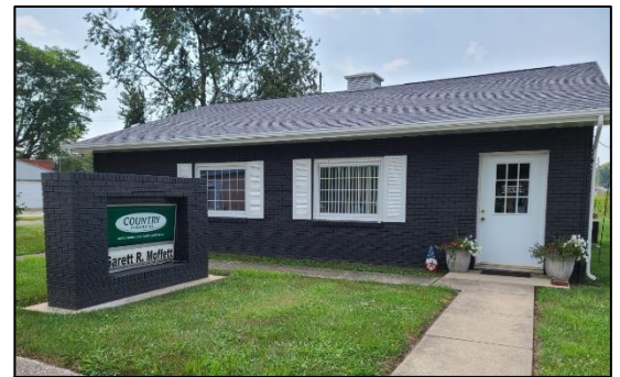
Country Financial modernized their building exterior in June with a new paint color.

They are making changes to the store by adding new lines and customer requests. They want to provide good customer service and enjoy the small town and community support.