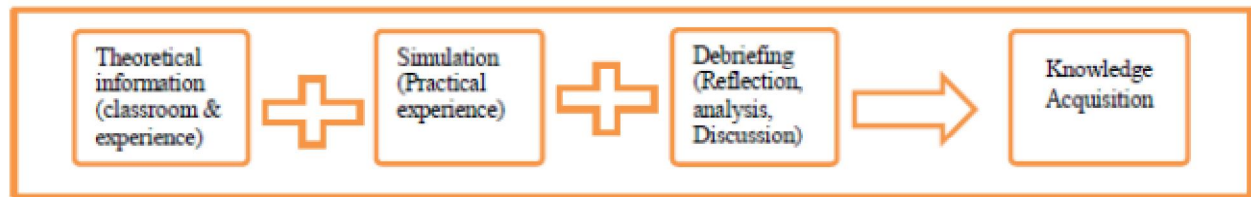
Fig (1) Process of Knowledge Attainment By Simulation

Figure (1) reviews the knowledge gaining from summary to simulation in theory, simulation application in training, updating and responses and lastly the process of information attainment. (18)