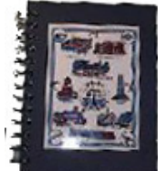
Journal ~ $10.00 7-1/4" X 5-1/2"