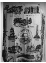
Quilt ~ $49.95