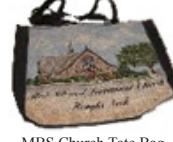
MBS Church Tote Bag 16" X 16"