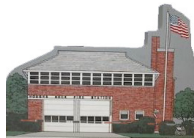
Houghs Neck Fire Station 6" X 4-1/4"