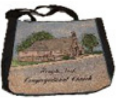
H N C Church Tote Bag 16" X 16"