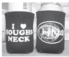
HN Can Koozie's ~ $3.00