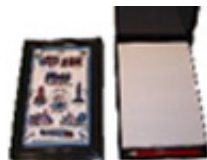
Note Caddy/Pad & Pencil $7.00 6-3/4" X 4-1/2"