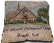
MBS Church Pillow 16" X 16"