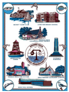
Magnet ~ $3.00