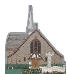
Most Blessed Sacrament Church 5-1/4" X 6"