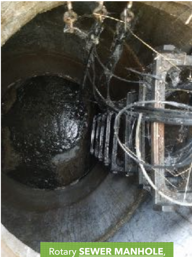
Rotary SEWER MANHOLE , cleaned out to the bottom.