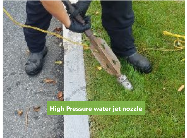
High Pressure water jet nozzle