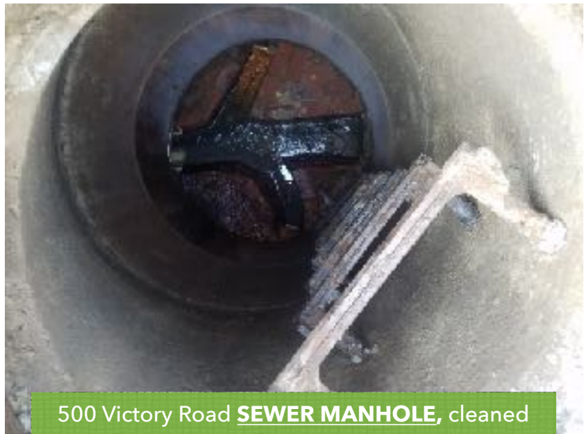
500 Victory Road SEWER MANHOLE , cleaned out to the bottom