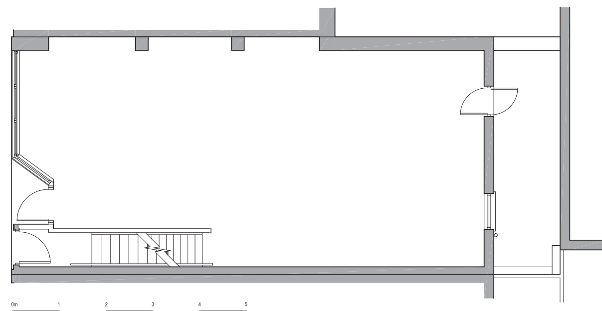
STREET LEVEL PLAN

CONTACT | dgourgy@jsmcorporation.ca 416.847.1850