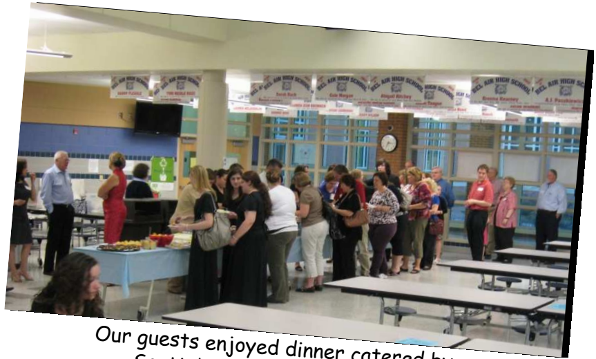
Our guests enjoyed dinner catered by Scotto's Café, Festival Bel Air