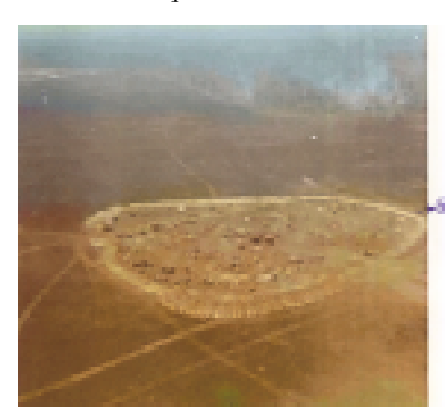
FSB Illingworth three hours before the attack

<sup>2</sup> 1 April 1970 At 0100 hours the "shit" literally hit the fan and the air was full of it. An intense barrage of 107mmm,