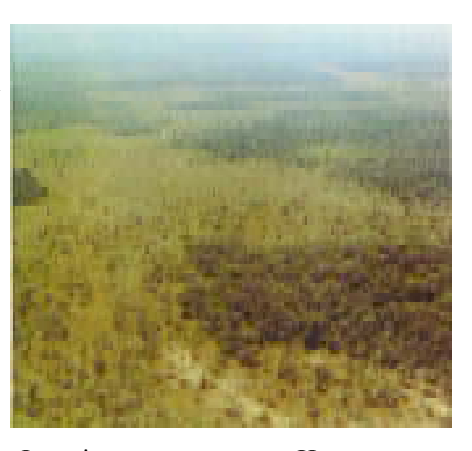
Insertion was never easy. Here are shown possible openings that may take one or two birds—a life or death decision they must make on approach. The NVA were battle-hardened soldiers with 20 years experience. They adapted quickly to US tactics often allowing enough troops to unload to ensure commitment but not enough to defend.. Here the support of ARA was all the difference between success and annihilation. Ground artillery took time to be adjusted but the ARA was immediately on target.

To crown the indispensability of the Army, the invincibility of the infantryman, the versatility of the helicopter is to combine these with the pinpoint accuracy and power of artillery. Thus, came about the Aerial Rocket Artillery, a unique blend of the best, one of the most effective weapons in the Vietnam conflict, and the subject of this article. This is the story of one of numerous times when the ARA figured so vitally in the preservation and success of the brave men who carried the cause of freedom in one of the corners of Hell. This is the story of the battle for FSB Illingworth on 1 April 1970 and the men of Battalion Hqs and Companies C (Charlie) & E of 2/8 Cavalry, B 1/17 Arty (105), A/1/30/Arty (155), A/2/32 Arty (8"), B5/2 Arty (Quad .50). A/2/20 ARA was in general support from Tay Ninh Base Camp. As with all ground units, C/8 depended on supporting fires from many places all around. Among these were HHQS & B/2/19 Arty, B/2/12 Arty, 1/11/ARC and B/2/32 Arty, located at Tay Ninh, FSB Barbara, Camp Hazard and FSB Hanna.