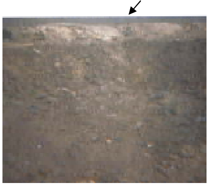
The 8 inch ammo crater. Perspective on size is gotten by comparing the soldier walking away (arrow) on the rim.

For a period of approximately one-half hour, supporting artillery was controlled by the 2-19 Arty BN FDC through the ARA section leader. One 105 was knocked out by enemy fire; the remainder kept up a heavy volume of continuous fire, with one gun firing self-illumination. The quad .50 gunner was then wounded and the gun damaged