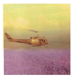
Grunts en route to an insertion in one of the few moments when they could leave the jungle heat and enjoy the cool wind of the skies

Oddly enough, this cycle returned to a few of the basics from which it had been spawned. One of these was to realize that in the end, only the ground on which you stand is yours, albeit some can be denied to the enemy, but only at the cost of self-deprivation. The infantryman is the heart and soul of the successful army. The Navy is useful for moving the material that the infantryman needs and the infantryman himself. The same can be said for the Air Force (whose very existence arose from the Army). The Marines try hard to be infantry but are lost in the Navy. In the final analysis there has never been a war won from the air or sea – only by the "grunt" slogging his way through the mud and chaos of the land. A grunt is the true reason for the existence of the helicopter. Every helicopter ever flown had one real purpose: To help the " grunt". It is unfortunate that many helicopters never had the opportunity to fulfill their one true mission in life, simply because someone forgot this fact.