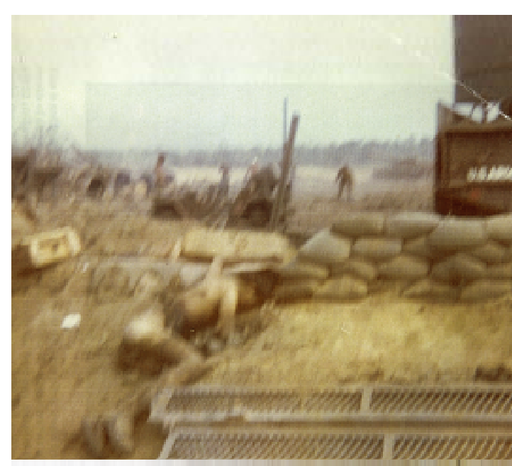
The Brass say there was no penetration. The camera says otherwise.

The years roll past, the events grow dim in memory, people also move on and away. In the Bible many of the legendary figures paused to create memorials for those who came behind to see and remember what had transpired there. C/2/8 has created just such a memorial and here it is. We, of the ARA, can proudly remember that we made a difference in the lives and fates of our brothers in arms.