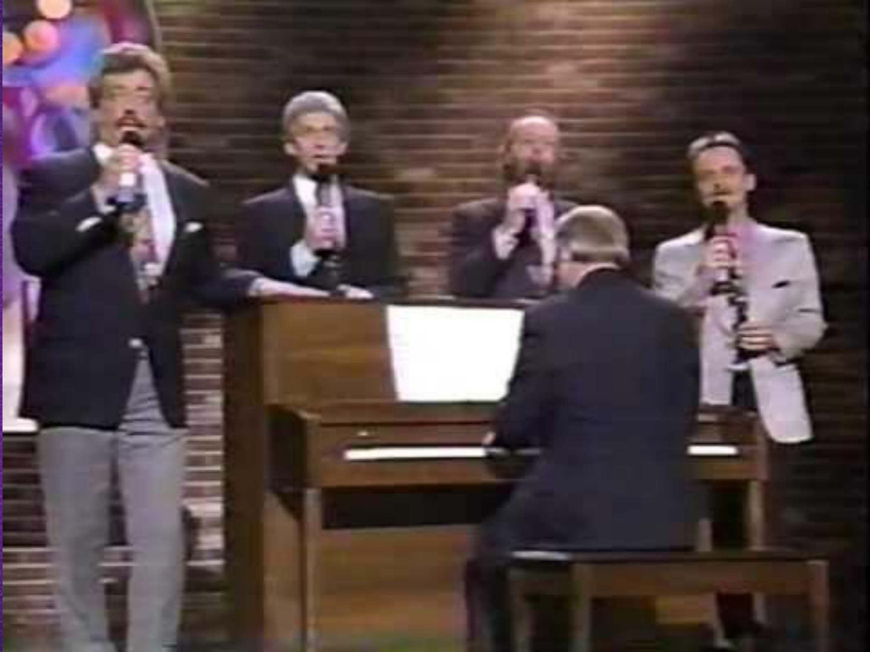
The Statler Brothers - Love Lifted Me