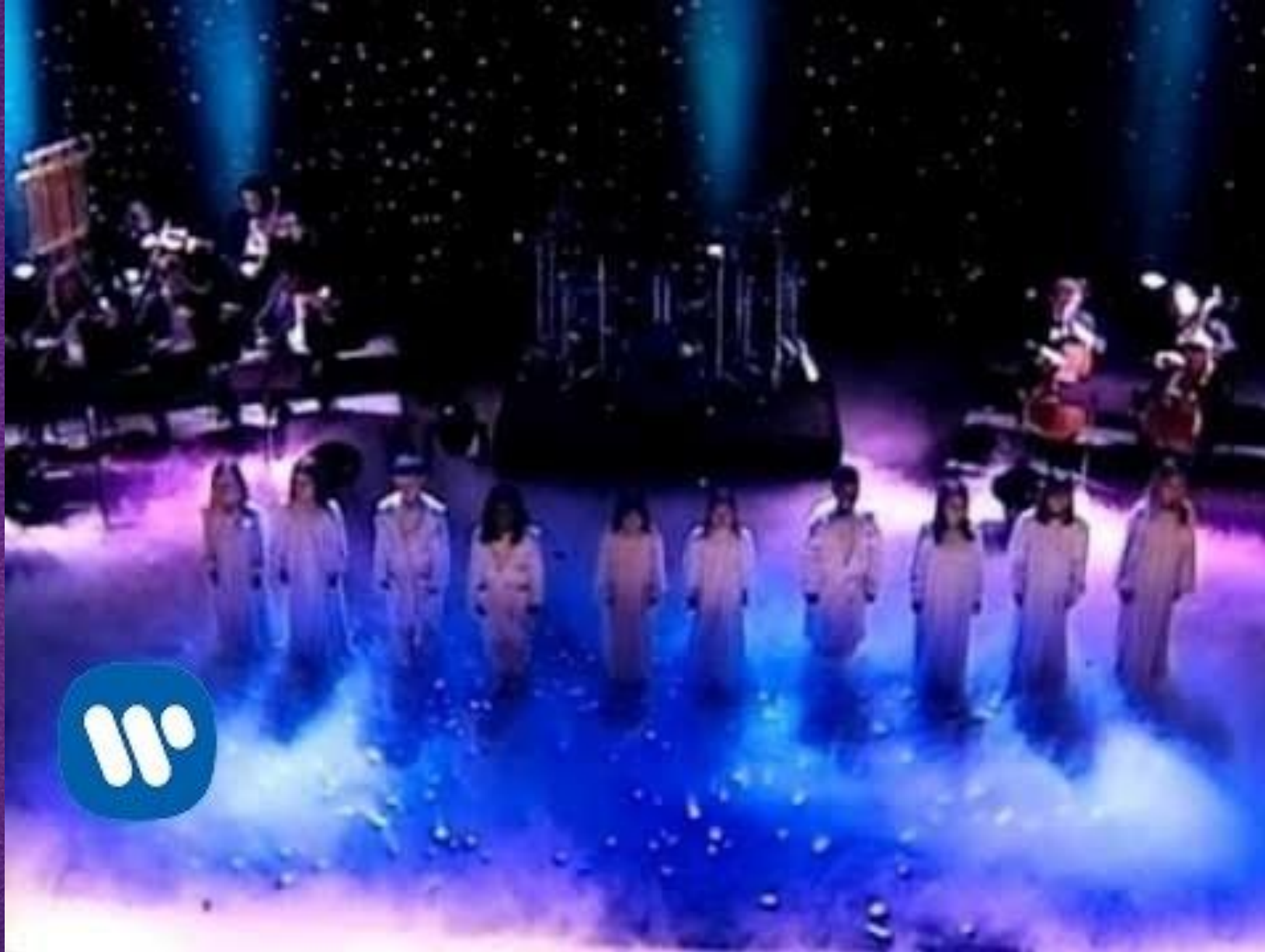
Trans-Siberian Orchestra - Christmas Canon (Official Music Video)