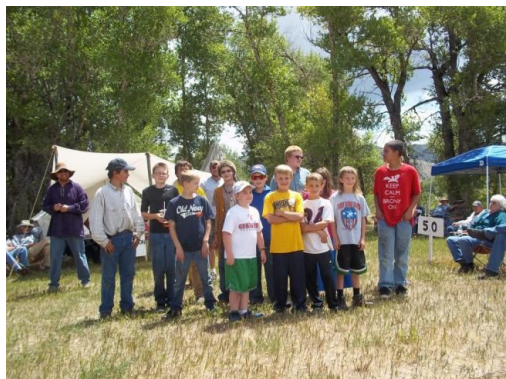
Big bunch of youth participating at Sierra Madre