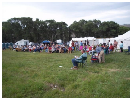
Large Crowd watching the knife and hawk throwing contests.