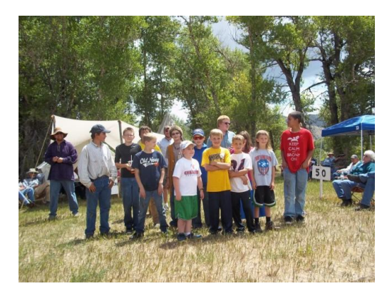
Big bunch of youth participating at Sierra Madre