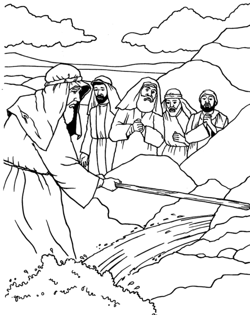
Moses Strikes the Rock Exodus 17:1-7

From BibleStoryCard Learning System(tm) Coloring Book © 1996 Wesleyan Publishing House Used by permission. Additional BibleStoryCard resources available by calling 1-800-493-7539 or visiting online http://www.parable.com/wph/group_1052.htm