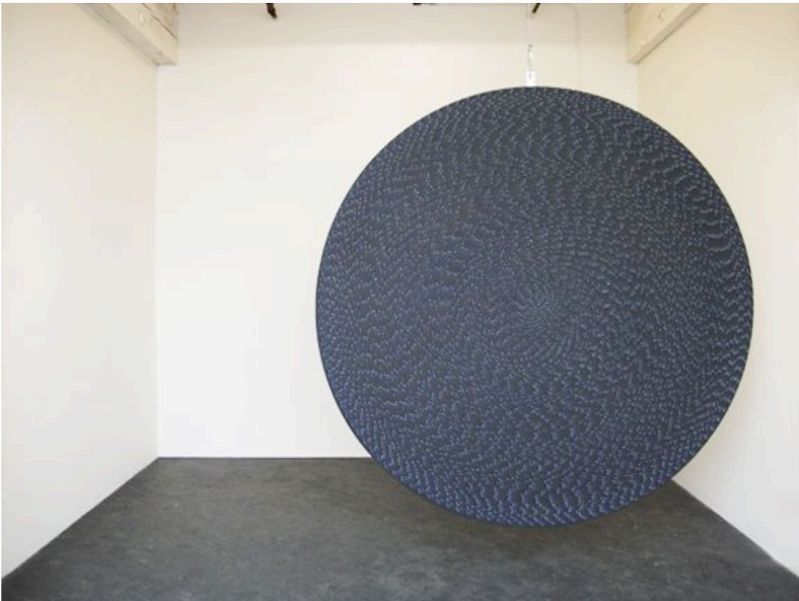
Untitled, 2010 Flashe and black gesso on canvas, 80 inch diameter

500 W Cermak Rd #727, Chicago, IL 60616 • www.peregrineprogram.com • 312.752.7375 ed@peregrineprogram.com