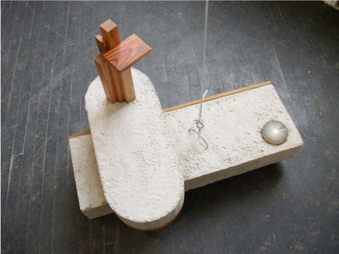
Counterweight: concrete, hardware, wood, silverpoint drawing

500 W Cermak Rd #727, Chicago, IL 60616 • www.peregrineprogram.com • 312.752.7375 ed@peregrineprogram.com