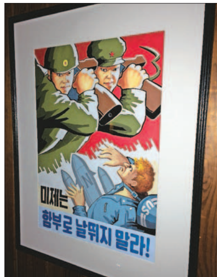
Propaganda poster showing North Korean soldiers attacking an “imperialist American,” who’s typically depicted with a hook nose and claw-like hands.

When I told friends and family I was planning a North Korea trip, their responses ranged from, “Aren’t you