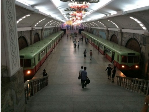
A subway station displays some very fancy chandeliers.

We also were warned repeatedly that if we took a photograph of any statue of the Kims, we needed to include the entire statue in the frame: no cutting off any arms or legs.