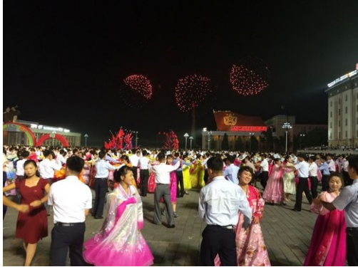
Fireworks punctuate the mass dance for Liberation Day.

We visited a traditional Korean restaurant for lunch, and one of the dining options was dog.