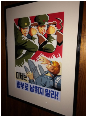
Propaganda poster showing North Korean soldiers attacking an "imperialist American."

I wondered if anything was staged for the benefit of our group: crafted scenes that might show how "normal" life is in North Korea. I honestly don't think that's possible given how many places we visited and how many people we saw. There also were times I was allowed to wander out of eyeshot of our tour leaders.