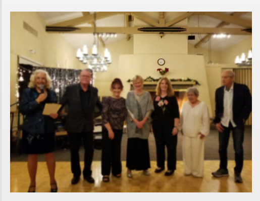
More Board Members ...