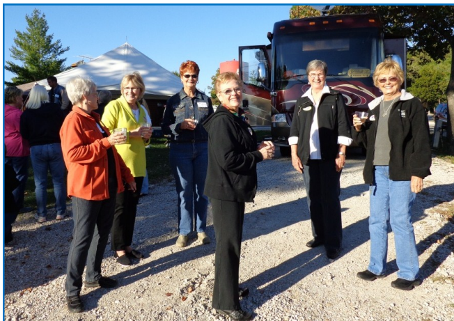
Visitin' during Happy Hour