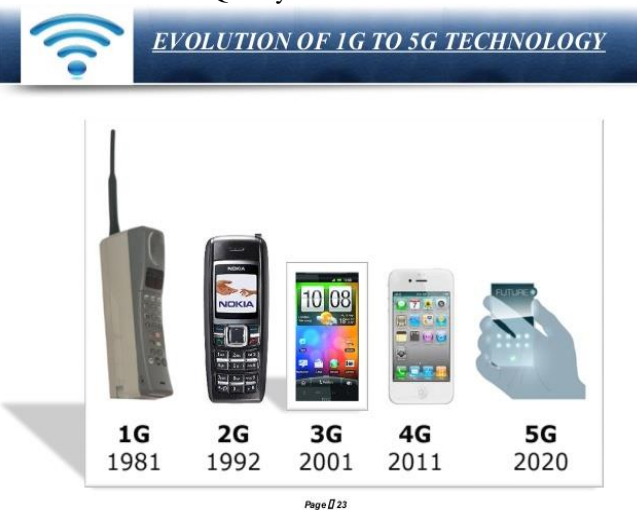
Fig 1: Evaluation of 1G to 5G Technology [1]