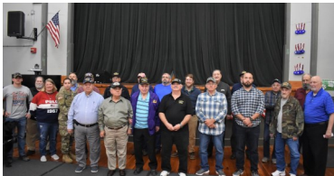
MHS honored vets on November 11.