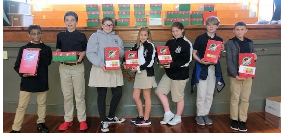
Jr Beta Samaritans Purse shoeboxes for Christmas

AP Human Geography Lesson. Students had to demonstrate Cultural Concepts using only the M&Ms mixed with Skittles. The concepts were centered on Ethnicity and Multi-Nationalism. The students couldn't speak but had to demonstrate the concepts by separating the M&Ms and Skittles to convey the concept.