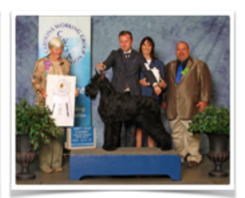
Group 4 GCH Skansen's Havannah