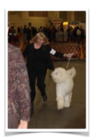
Meadow View Winner Take All, "Ace"

11/13/2014 (CWGA) BW/BOS , 4 pt major ; 11/15/2014 (GMKC) WD ; 12/6/2014 (Forsyth KC) WD ; 12/7/2014 (Forsyth KC) WD