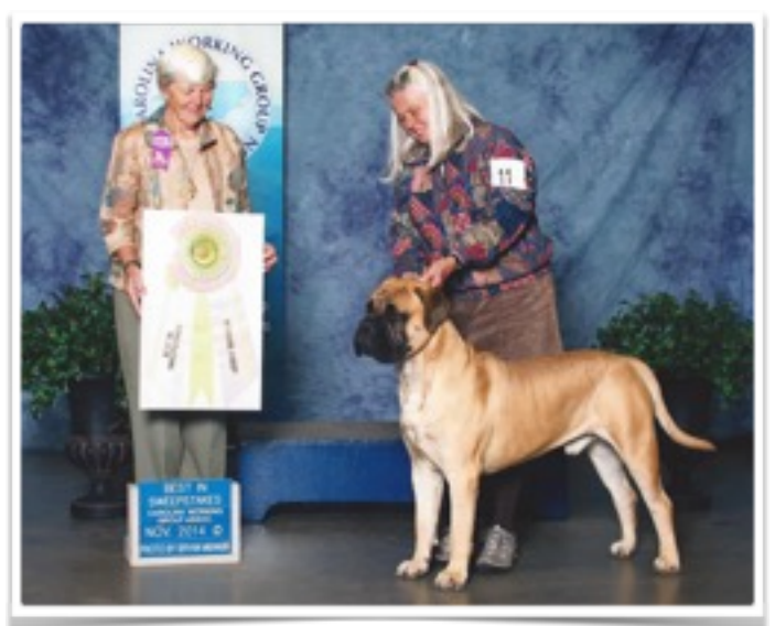
Best in Puppy Sweepstakes Dragonfly and ELOC Are Ringing In The New