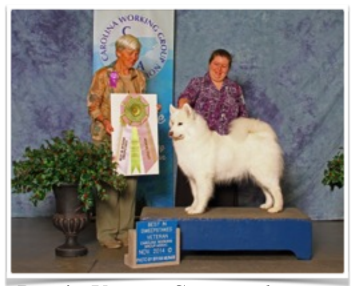
Best in Veteran Sweepstakes CH Doubletake's She's Got It RE OA OAJ CA

CWGA Owner-Handler Group 1 CH Trillium Blue's Sweetgrass Purple Reign