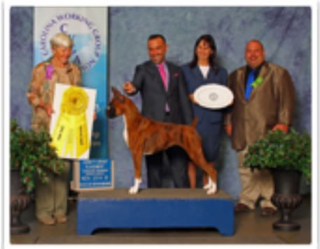
Group 3 CH Mephisto's Speak Of The Devil