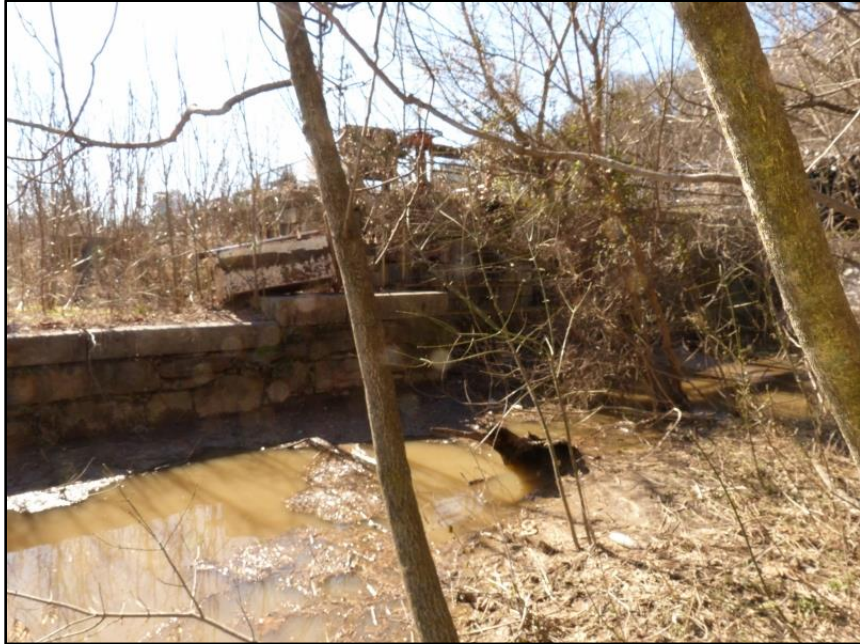
3. Exterior view of the water works canal facing southeast.