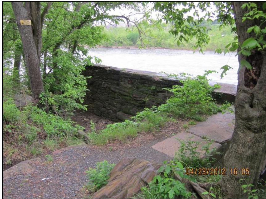
12. Southeast view of Scott's Mill ruins.