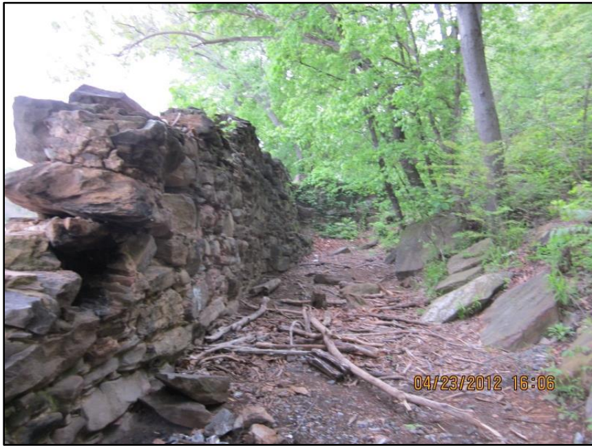
10. West view of Scott's Mill ruins.