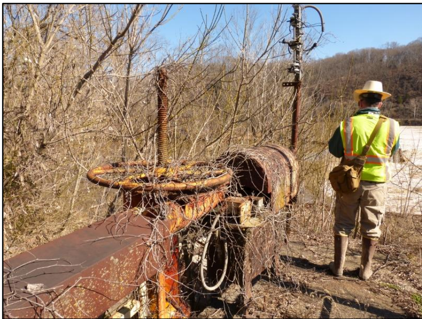
4. North view on top of the control gate of the water works canal.