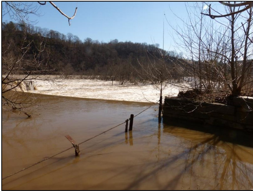
8. Northeast view of the horseshoe-shaped (water works) section of the dam. Note the complete inundation of the small island downstream from the dam.