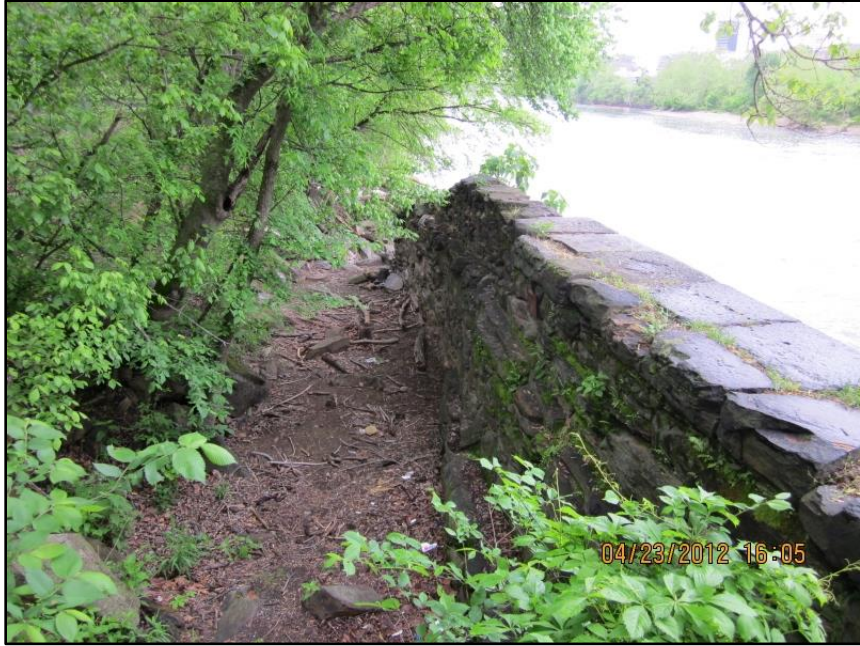
13. East view of Scott's Mill ruins.