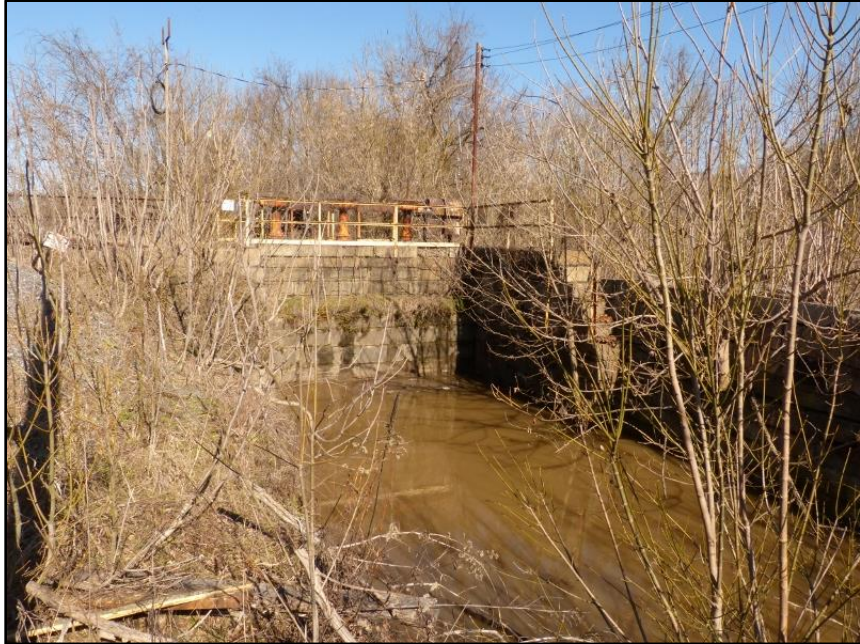
5. Interior view of the water works canal facing northwest.