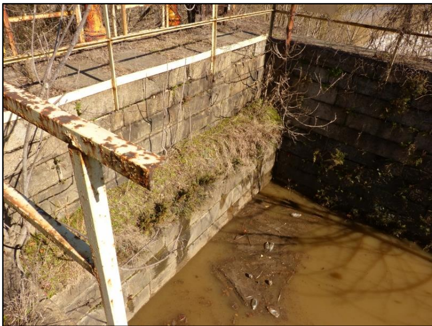
6. Closeup interior view of the water works canal facing northwest.