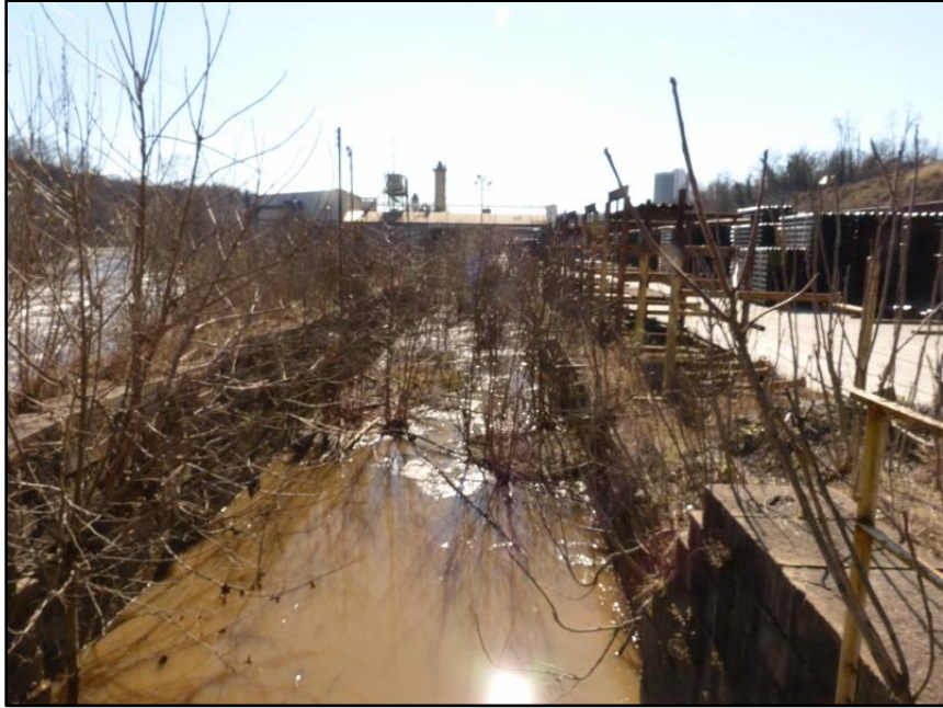
7. East view of the water works canal from the top of the control gate.