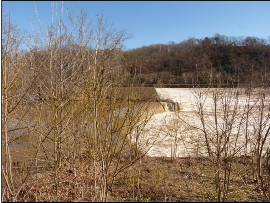
9. North view of the Scott's Mill Dam from the top of the water works canal.