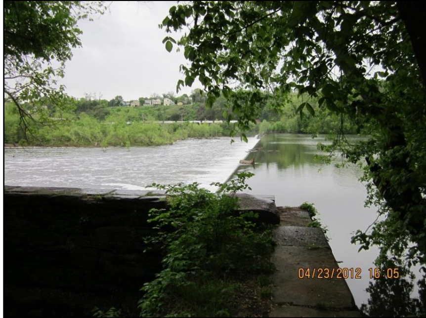
11. South view of Scott's Mill ruins.