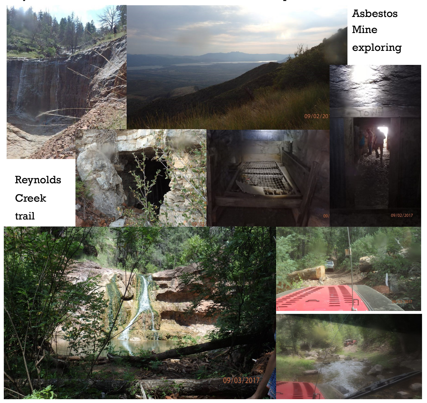
View from the end of Asbestos loop