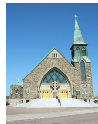
Saint Augustine's 340 Dominion Street Moncton, NB

July 14th, 2019 Fifteenth Sunday in Ordinary time